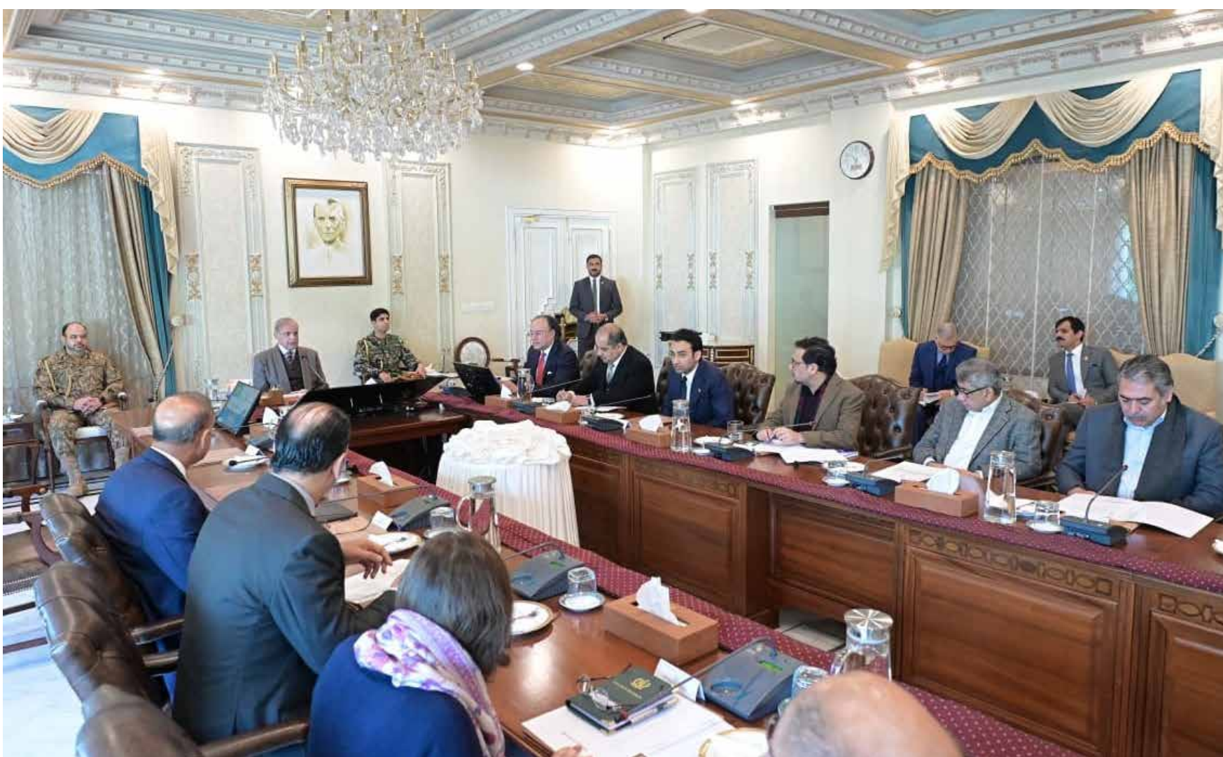
ISLAMABAD: Prime Minister Muhammad Shehbaz Sharif chairs a high level meeting on loans to SME and Agri-Sector.

WASHINGTON: The US seized a Russian-flagged oil tanker that was being shadowed by a Russian submarine on Wednesday, after a more than two-week-long pursuit across the Atlantic as part of a US "blockade" of Venezuelan oil exports, two US officials told Reuters. This appeared to be the first time in recent memory that the US military has seized a Russian-flagged vessel. The operation took place after the tanker, originally known as the Bella-1, slipped through a US maritime blockade of sanctioned tankers in the Caribbean and rebuffed US Coast Guard efforts to board it. The seizure effort was first reported by Reuters. In a post on X, the US military's European Command said the Trump administration had seized the vessel for violating US sanctions. "The blockade of sanctioned and illicit Venezuelan oil remains in FULL EFFECT — anywhere in the world," US Defense Secretary Pete Hegseth said in reply to that post.—APP