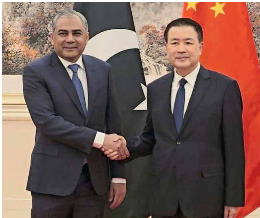
BEIJING: Interior Minister Mohsin Naqvi met with his Chinese counterpart, Wang Xiaohong, at the ministry's headquarters.