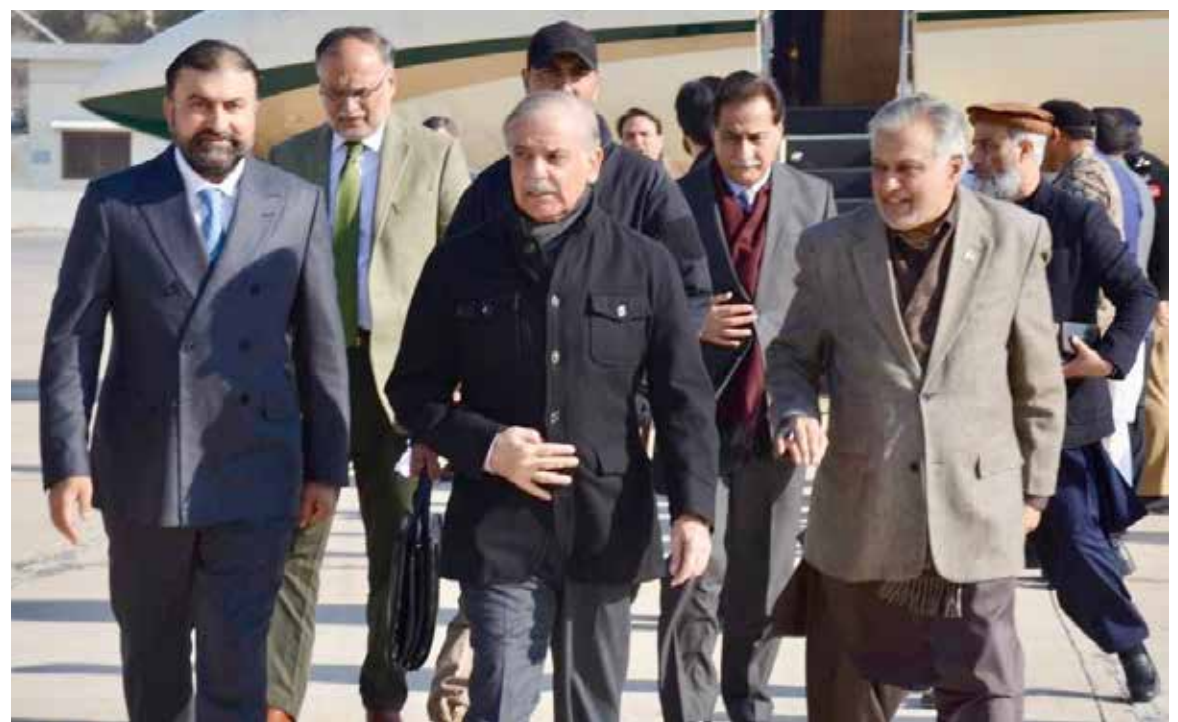
QUETTA: Prime Minister Shehbaz Sharif, along with Deputy Prime Minister, Speaker National Assembly and others arrives in Quetta.