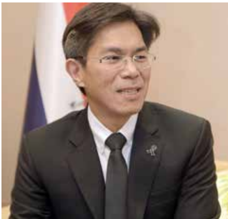
ISLAMABAD: Ambassador of Thailand talking to Daily Islamabad POST.