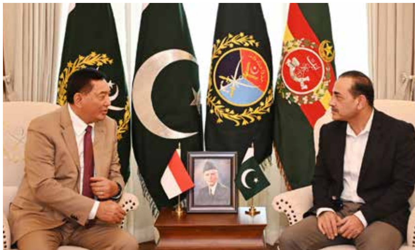
RAWALPINDI: Defence Minister of Indonesia Lt. Gen(Rtd), Sjafrie Sjamsoeddin met with Field Marshal Syed Asim Munir in Rawalpindi. – DNA