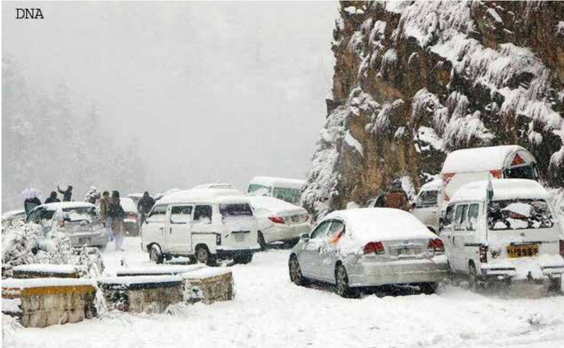
MURREE: Heavy snowfall on Friday left a large number of vehicles stranded at the hill resort, disrupting traffic and causing difficulties for visitors. – DNA