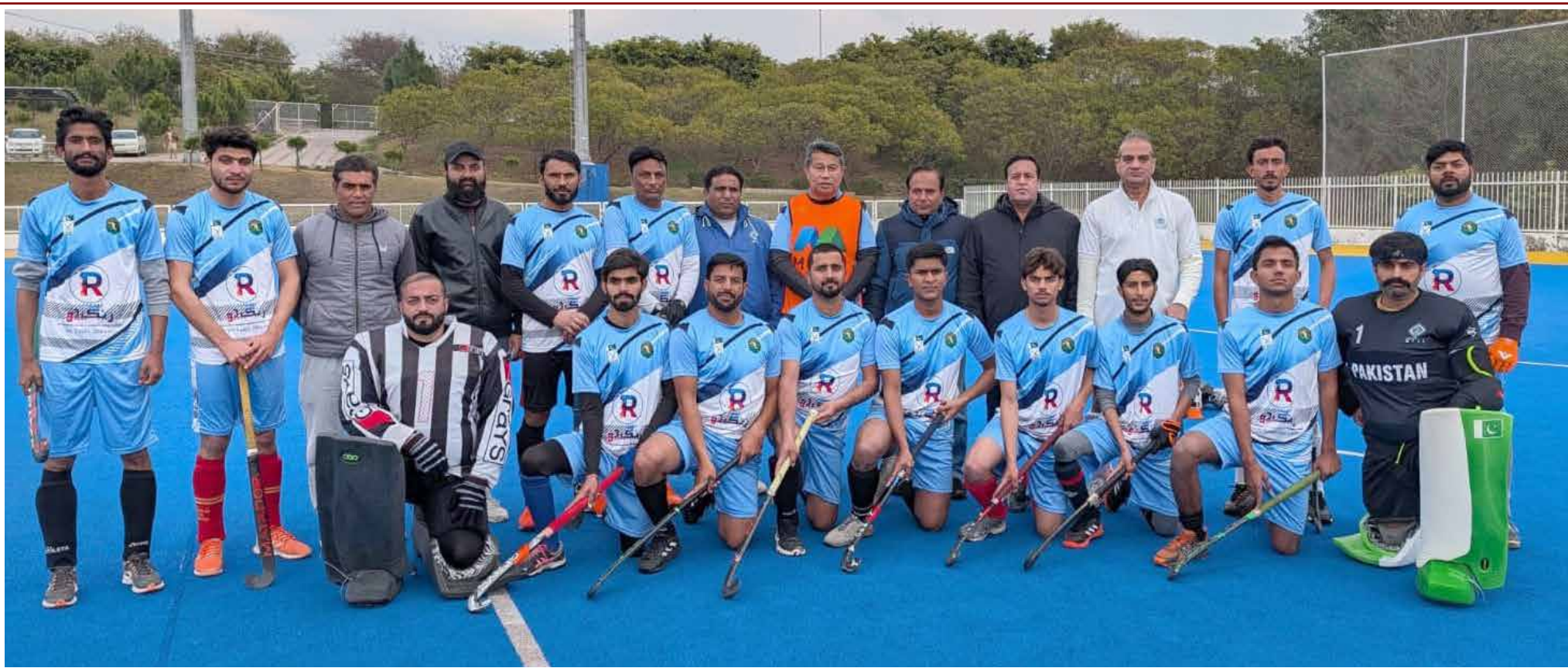
ISLAMABAD: Players of Rising Stars Hockey Club posing for a picture during a match with Mari Petroleum. The team management is also seen in the picture.

issued a clarification regarding the closure of entry points to Murree after weather conditions worsened. Officials said the decision was taken in response to snowfall and traffic pressure on access routes. Entry points were opened only for local residents. According to the administration, residents were allowed entry after identity cards were checked at control points. All other traffic, including tourist vehicles, was stopped from entering the city. The measure was intended to reduce congestion and support movement for essential needs. The administration appealed to tourists to cooperate with authorities and avoid travel to Murree until the weather improved. A spokesperson said the restrictions were temporary and aimed at public safety and traffic management. The district administration reported that traffic flow on the express highway was disrupted due to lack of cooperation from some road users. Authorities said vehicles ignoring instructions added to congestion and delayed clearance work. Traffic police and district officials jointly appealed to both residents and tourists to follow directions at checkpoints and on highways. They said cooperation would help restore traffic flow and allow faster reopening of routes. Heavy machinery has been deployed across Murree to remove snow from roads. Officials said clearance work is ongoing at multiple points to ensure safe passage once conditions allow.