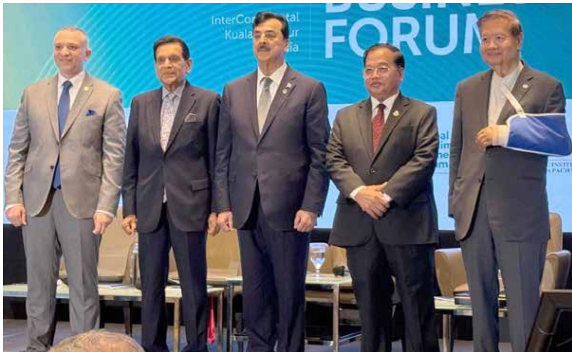
Group photo of Chairman Senate of Pakistan, Syed Yousaf Raza Gilani with the participants of the Global Muslim Business Forum (GMBF).

tion. "This is a very big tragedy. There is no price for a human life," the chief minister said, adding that families of those who lost their lives would receive Rs10 million each. CM Murad added that a committee had been directed to assess losses and that the Sindh government would pay the damage. "The Sindh government will give Rs500,000 immediately to every shopkeeper," he said, adding that lists of affected traders had been ordered to be compiled by Monday. As a temporary arrangement to keep shopkeepers' business going, the chief minister said that 500 shops in one building and 350 in another had been arranged, with owners agreeing not to charge rent for a year. He added that the provincial government would provide collateral for Gul Plaza shopkeepers to obtain loans of up to Rs10 million, with the government bearing the interest cost.