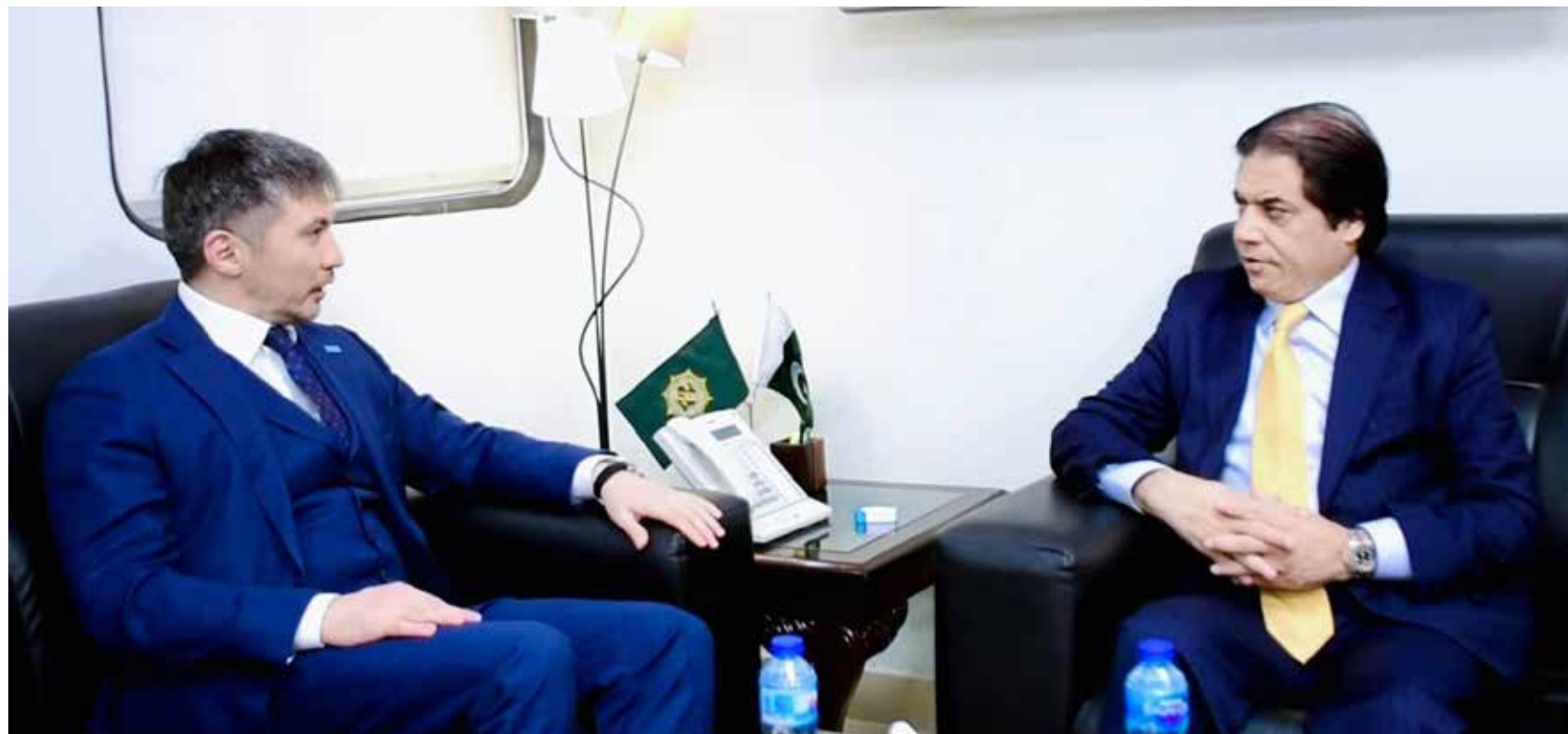
ISLAMABAD: Federal Minister for Railways Muhammad Hanif Abbasi meeting to discuss Pakistan Railways' mega project with Kazakhstan Ambassador Yerzhan Kistafin.

According to the Ministry of Railways, the Pakistan–Kazakhstan railway connectivity project is estimated at $7 billion and is planned to be completed within a record period of three