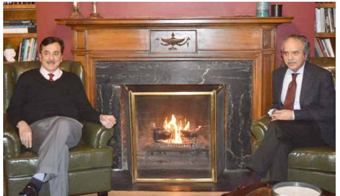
NEW YORK: Pakistan's permanent representative to the United Nations Asim Iftikhar Ahmed hosted Chairman Senate Syed Yousaf Raza Gilani and his delegation, on Friday.