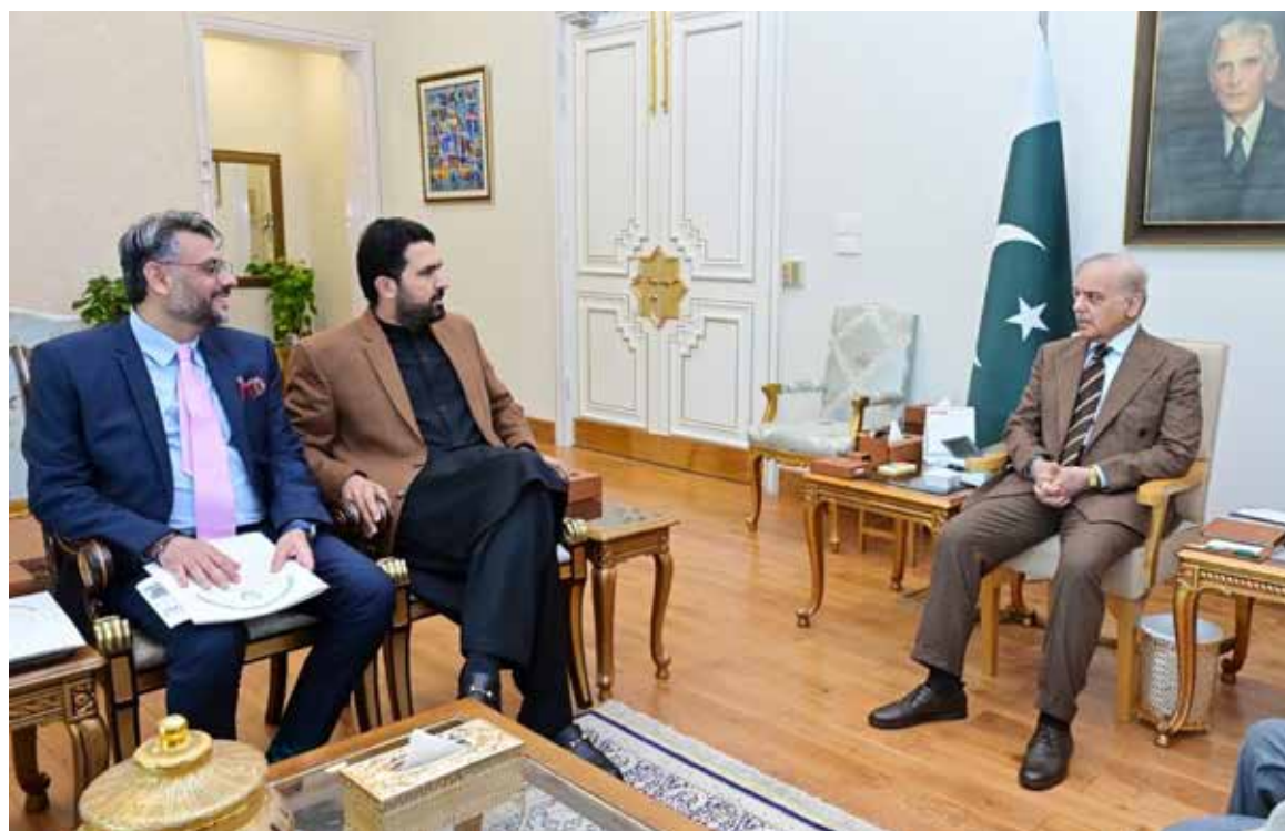
ISLAMABAD: Chief Minister KP Sohail Afridi called on Prime Minister Shehbaz Sharif.