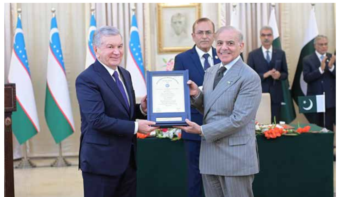
ISLAMABAD: Prime Minister Muhammad Shehbaz Sharif Presenting the Honorary Degree of Doctorate to President of Uzbekistan Shavkat Mirziyoyev conferred upon him by NUST. Islamabad, 5 February 2026.