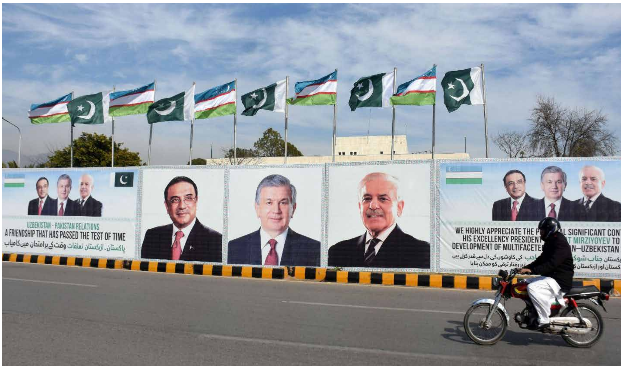
ISLAMABAD: Roads of the Capital decorated with flags of Pakistan and Uzbekistan to welcome the Uzbek President on his two-day visit to Pakistan.