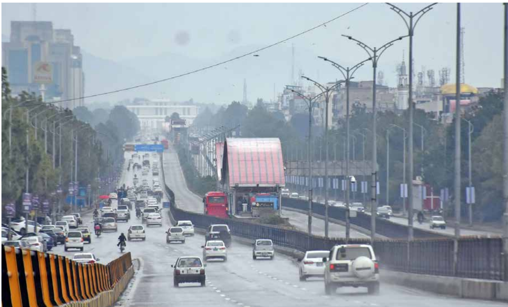
ISLAMABAD: Motorists are on their way at Jinnah Avenue during rain fall as after the rainy weather, coldness increase once again in Federal Capital.

Selected from a highly competitive global pool, the 14 winning projects form a single, yet diverse cohort spanning Africa, the Middle East, and the Americas. Together, they represent a collective commitment to breaking down siloes across disease programmes and strengthening how research, policy, advocacy, and implementation intersect to accelerate disease elimination. The Falcon Awards are designed to catalyse innovation and collaboration in disease elimination by supporting projects that demonstrate how integrated approaches across diseases, sectors, and systems can deliver greater impact, sustainability, and resilience. The Integration Edit places a deliberate emphasis on bridging research and advocacy, strengthening surveillance and diagnostics, advancing vector control, and embedding elimination efforts within national health systems. "The Falcon Awards catalyse evidence-driven action to advance disease elimination through integrated, real-world solutions," said Dr Farida Al Hosani, CEO of GLIDE. "This cohort reflects the power of collaboration across borders and disease areas, and the critical role of locally-grounded leadership in driving sustainable progress." Throughout the duration of the projects, GLIDE will work closely with each awardee to support project design.—APP