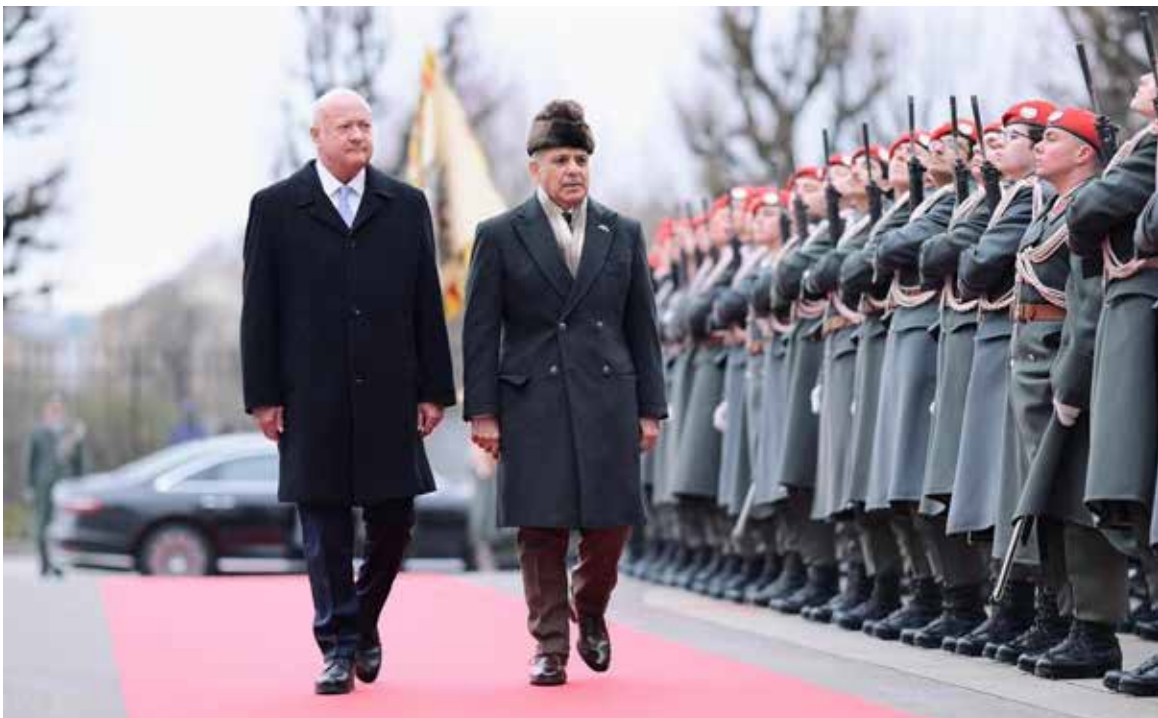
VIENNA: Prime Minister Muhammad Shehbaz Sharif was presented Guard of Honour upon arrival in Austria's Federal Chancellery.