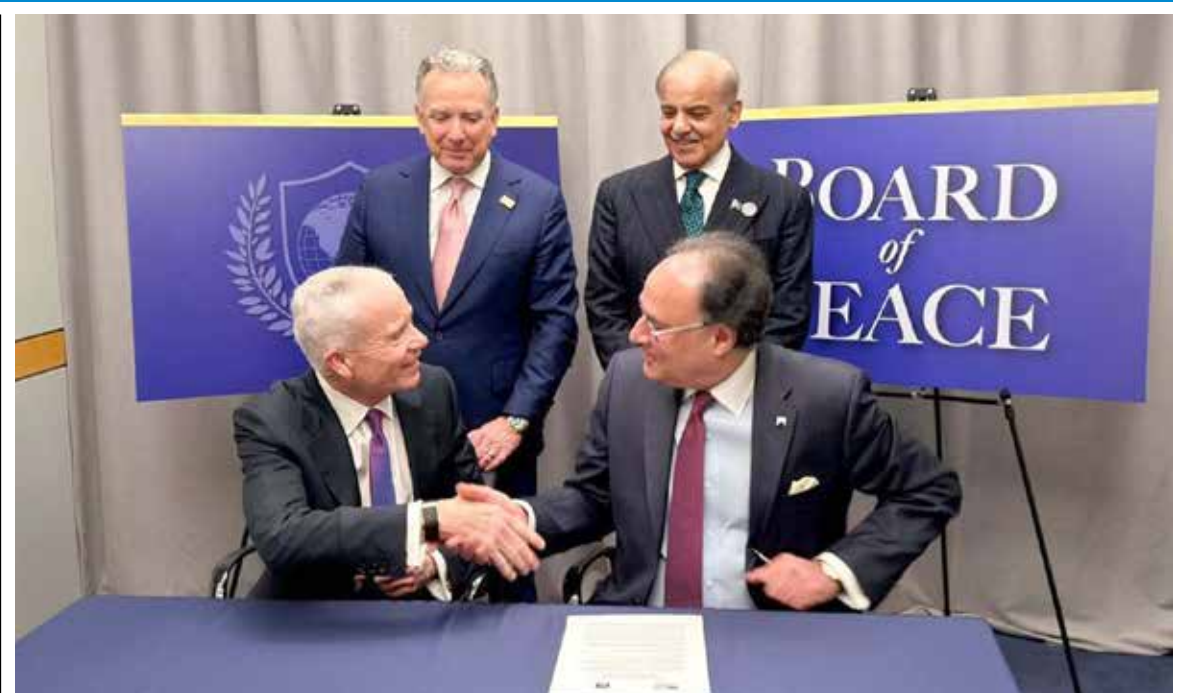
WASHINGTON D.C: GSA Administrator Edward C. Forst and Federal Minister for Finance and Revenue Senator Muhammad Aurangzeb exchange a handshake after signing a Memorandum of Understanding between the United States and Pakistan.