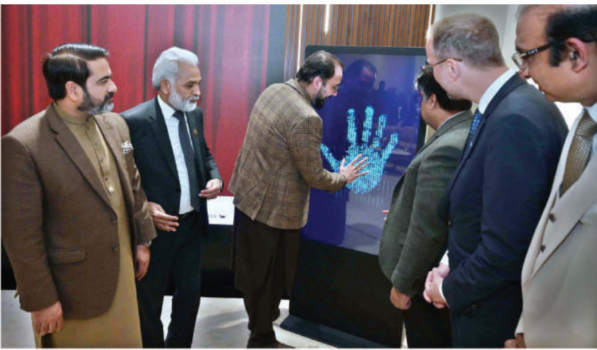
ISLAMABAD: Federal Minister for Overseas Pakistan and HRD, Chaudhry Salik Hussain inaugurates MIS and Mobile Application for Worker Welfare Fund users at a local hotel in the Federal Capital.

ISLAMABAD: Pakistan Railways transported 8.2 million tonnes of freight during the financial year 2024-25, carrying petroleum products, containers, coal, rock phosphate, fertilizer, wheat and other bulk commodities. As per the National Transport Policy 2018, the department is envisaged to play a primary role in logistical freight movement between industrial zones across the country and to seaports, said an official in the Ministry of Railways. However, the official said that ageing infrastructure, limited line capacity and shortages of rolling stock have constrained freight operations. To address these challenges, the official said Pakistan Railways has initiated several measures to enhance freight transportation. Among them is the construction of a 104-kilometre railway line, in collaboration with the Saudi government.—APP