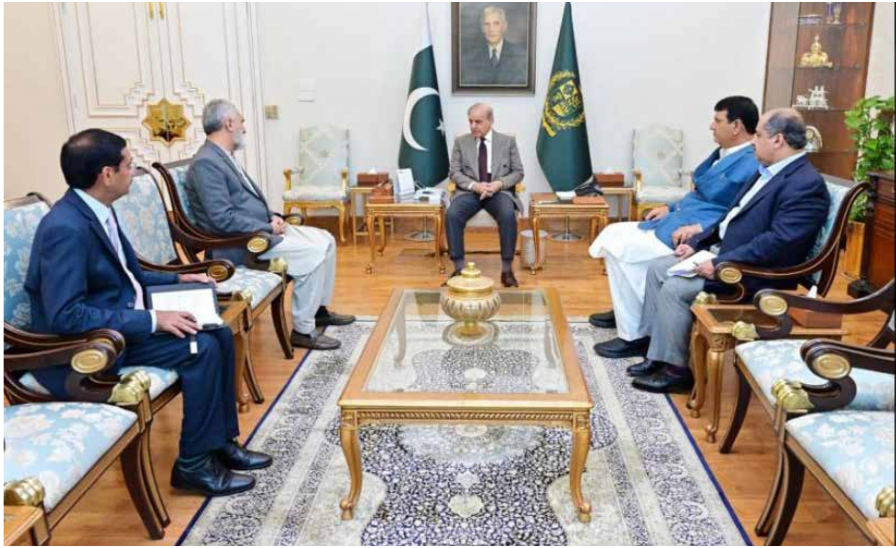
ISLAMABAD: GB CM Justice (R) Yar Muhammad called on Prime Minister Muhammad Shehbaz Sharif, Federal Minister for Kashmir Affairs, Gilgit-Baltistan and States and Frontier Regions Division. Engir Amir Muqam was also present in the meeting.

BAGHDAD: Iraq's civil aviation authority said it was reopening the country's airspace on Wednesday following the announcement of a US-Iran ceasefire, after it was closed due to the Middle East war. "The Iraqi Civil Aviation Authority announces the reopening of Iraqi airspace to air traffic effective today, following the stabilization of the situation and the return of conditions to normal," it said in a statement.—APP