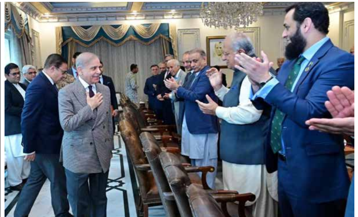
ISLAMABAD: Cabinet members greet Prime Minister Shehbaz Sharif when he arrives to chair the meeting. The members lauded PM efforts for securing a ceasefire.

Trump says US will 'dig up' uranium buried in Iran