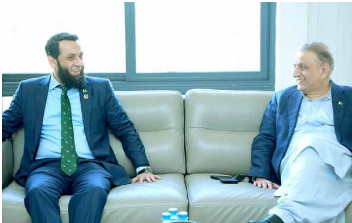
ISLAMABAD: Federal Minister for Information Attaulah Tarar called on Federal Minister for Communications Abdul Aleem Khan.

sandbox framework, signed memoranda of understanding with international regulatory counterparts, and has made significant progress to advance the regulatory architecture. With the Virtual Assets Act now enacted, PVARA has launched its recruitment drive to build the permanent institutional capacity that will take Pakistan's virtual asset framework from foundation to full operation. With Pakistan ranked among the top three countries globally in crypto adoption, the Authority reaffirmed its commitment to building a regulatory framework that protects consumers, ensures financial integrity, and positions Pakistan as a destination for responsible virtual asset innovation.