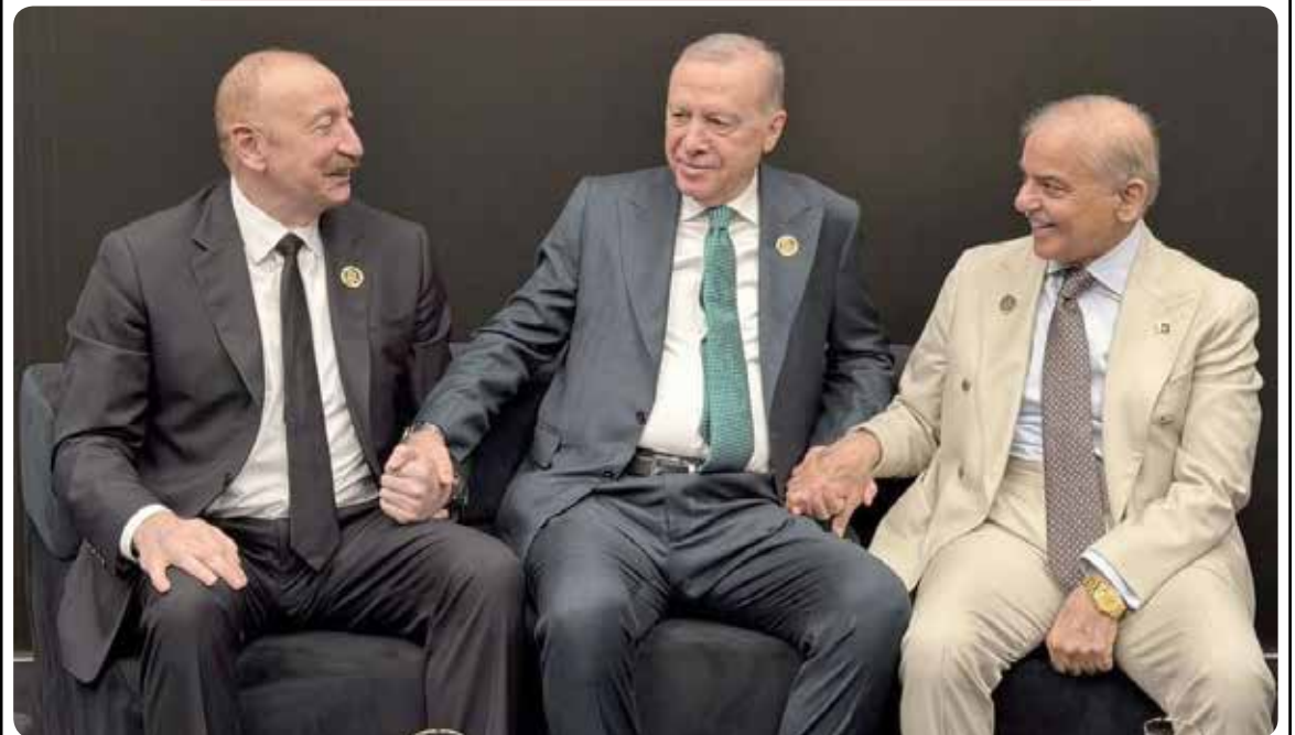
ANTALYA: Prime Minister of Pakistan Shehbaz Sharif, President Recep Tayyip Erdoğan of Türkiye, President Ilham Aliyev of Azerbaijan, and Pakistan's Deputy share a warm moment together at the Antalya Diplomacy Forum.