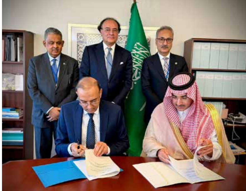
Islamabad at the directives of King Salman bin Abdulaziz Al Saud and Crown Prince Mohammed bin Salman. Earlier that day, the central bank said it had received $2 billion from Saudi Arabia "in the value date of April 15, 2026". FinMin Aurangzeb had