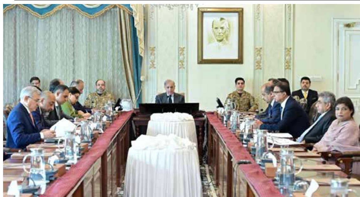
ISLAMABAD: Prime Minister Muhammad Shehbaz chairs a meeting on promotion of electric vehicles in the country (22 April, 2026).

The Motor Vehicle Development Act, the sources said, gives the Engineering Development Board a statutory basis for the new regime of environmental and safety standards for vehicles. It has been submitted to parliament and is expected to be approved by the National Assembly before the end of June 2026. With commercial importation now legalised, the government has abolished the personal baggage scheme and tightened the criteria for the gift and transfer of residence schemes for used vehicle imports, in order to avoid misuse of these schemes, the sources concluded.