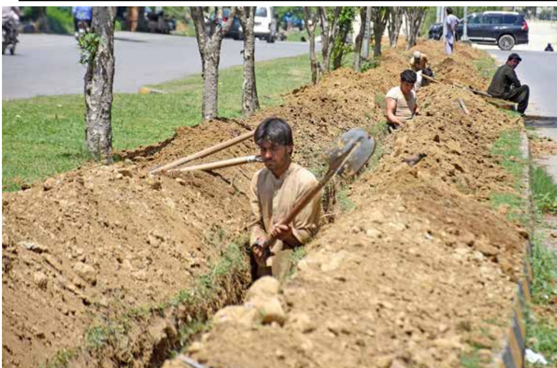
ISLAMABAD: Laborers busy in digging for lay cable under Safe City Project at Sector G-8 in the Federal Capital.

ISLAMABAD: Sitara Petroleum Service Limited (SPSL) has announced an Initial Public Offering (IPO) to raise Rs4.8 billion for expanding its fuel retail network, logistics, and storage infrastructure, according to its prospectus. The company is offering 279.9 million ordinary shares, which make up 16.66% of its post-IPO paid-up capital. Out of these, 168 million shares will be offered to the public, while 111.9 million shares have already been sold through a pre-IPO placement. The book-building process will take place on May 4-5, followed by public subscription on May 11-12. The IPO will be conducted at a floor price of Rs 13.50 per share, with a price band of up to 40%, setting the upper limit at Rs 18.90. Around 75% of the shares will be allocated to institutional investors and high-net-worth individuals.—APP