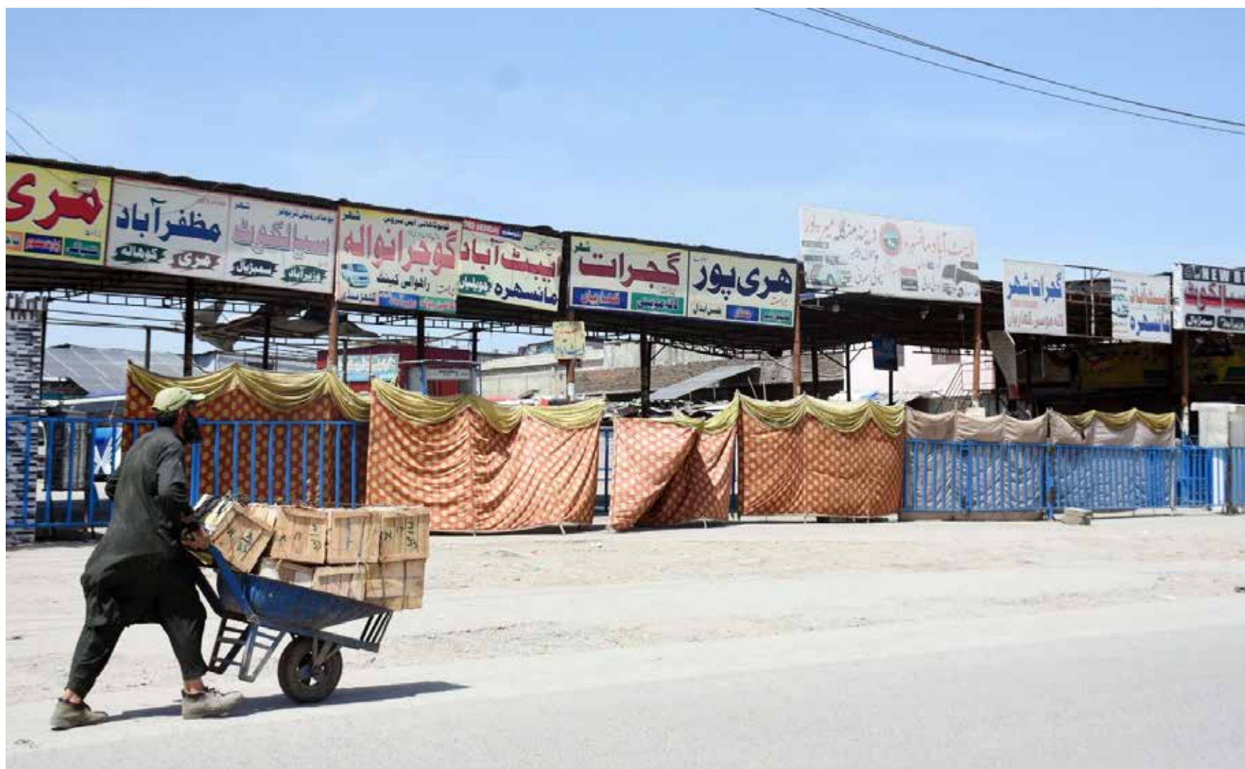
ISLAMABAD: A labourer pushing his wheelbarrow in front of closed bus terminal in I-11 sector in the Federal Capital. Transport terminals temporarily shut down as authorities enforce security measures ahead of a proposed second round of talks between Iran and the United States.