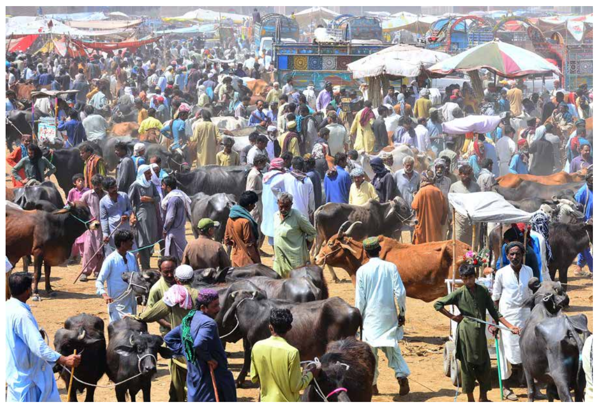
HYDERABAD: A large number of customers select and purchase cows and buffaloes at the weekly animal market near Hatri Bypass.

earth is not only for the present generation but a trust for the future. She emphasized the need for collective efforts to protect natural resources and trees. The CM paid tribute to individuals and organizations working for environmental protection and harmony with nature, and directed all provincial ministers to actively participate in plantation drives and public awareness campaigns for environmental conservation. The chief minister stressed forest protection, reduction in carbon emissions, and promotion of a green economy, stating that Punjab has adopted a zero-waste plastic policy. She also highlighted the establishment of the province's first "Smart Environment Force" for environmental protection. CM Maryam Nawaz said controlling pollution, conserving natural resources, and mitigating the effects of climate change are essential for improving environmental health. She added that the government is working on a 10-year climate change action plan along with several mega projects aimed at improving environmental conditions and ensuring a greener, healthier future for coming generations.—DNA