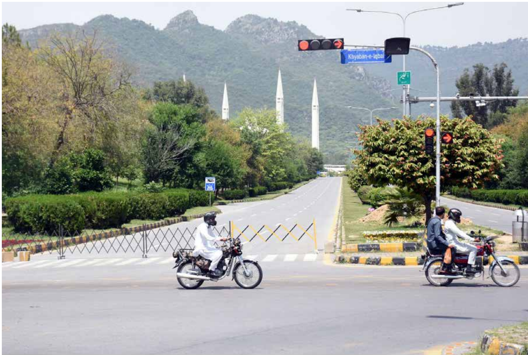
ISLAMABAD: Motorcyclists riding past the closed Faisal Avenue, closed for traffic due to possible second phase of peace talks between Iran and US in the Federal Capital.