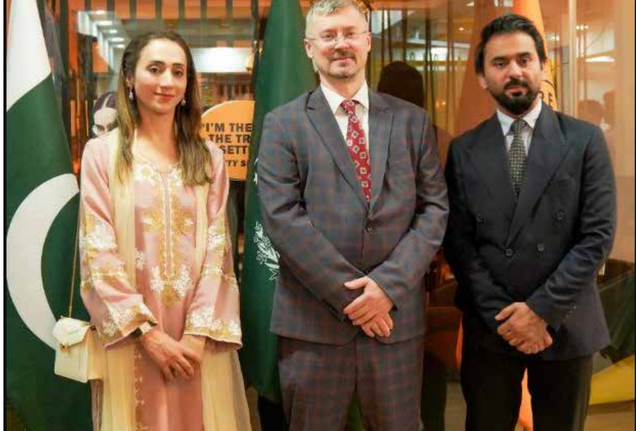
cal compositions, including a Russian melody alongside traditional Pakistani tunes, symbolising cultural harmony.