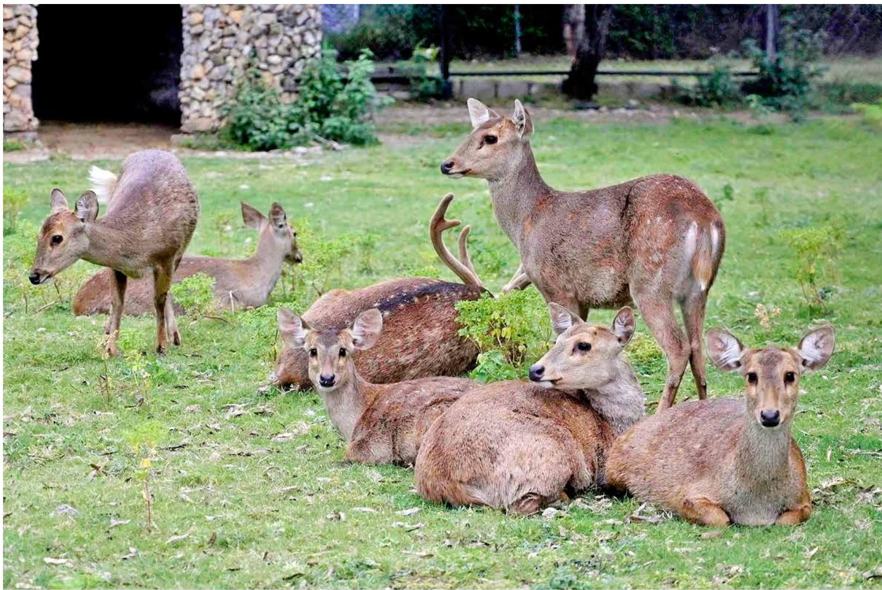
ISLAMABAD: A herd of deer rests and roams freely in its natural habitat at Margalla Hills National Park in the federal capital.