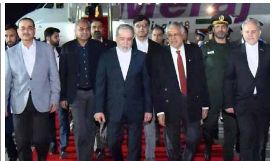
ISLAMABAD: Deputy Prime Minister Ishaq Dar, Field Marshal Syed Asim Munir and others received the Iranian foreign minister.