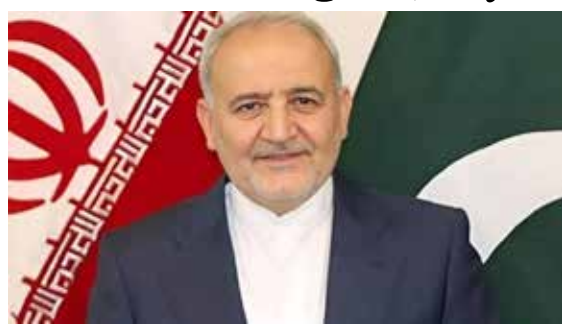
SAIFULLAH ANSAR / DNA

New negotiation plan conveyed through Islamabad to Washington, says Ambassador Moghadam