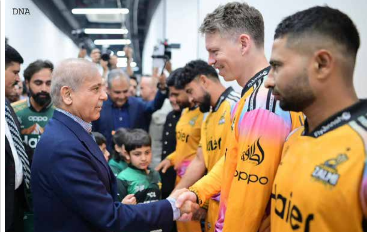
LAHORE: PM Shehbaz Sharif meets with the players of Peshawar Zalmi. Peshawar Zalmi won the PSL 11's Final by defeating the Hyderabad Kings.