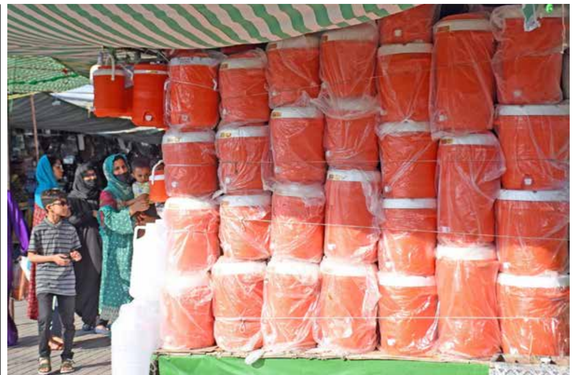
ISLAMABAD: A family buying water cooler in a Sunday weekly bazaar, in the Federal Capital.

be tied directly to the mandatory, timely clearance of employee salaries and job security. At the same time, professional journalism is being undermined by the unchecked proliferation of untrained individuals on digital platforms. Operating without formal training, these voices often disregard verification processes, media ethics, and defamation laws, creating an uneven playing field where sensationalism eclipses nuanced reporting. This creates an environment of misinformation that harms the credibility of real, investigative journalists. In the face of these monumental challenges, the