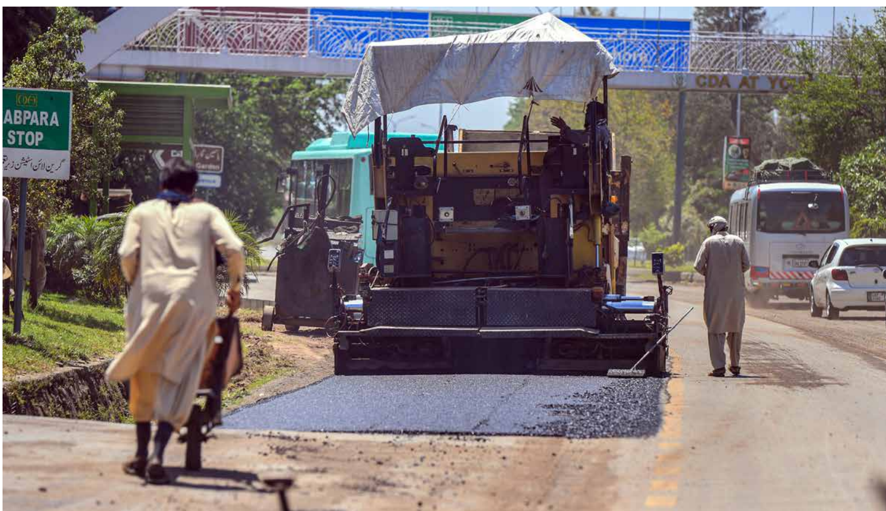
ISLAMABAD: Workers repairing a section of Srinagar Highway by laying asphalt during ongoing road maintenance work.