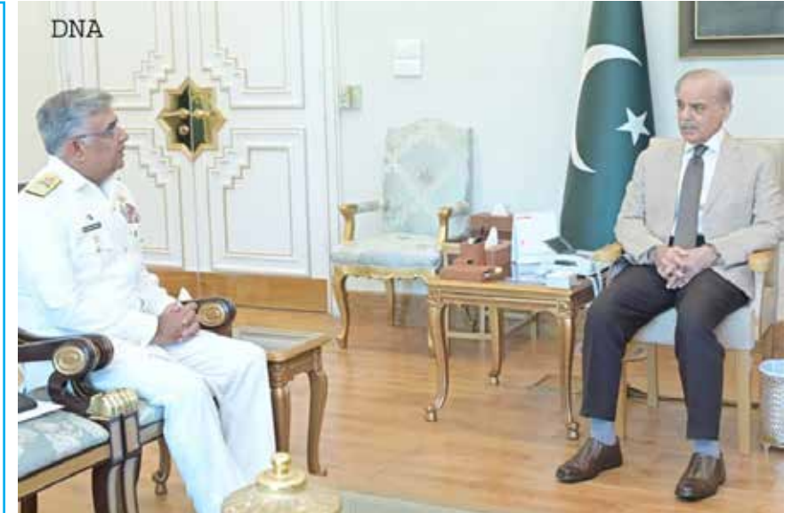
ISLAMABAD: Chief of Naval Staff Admiral Naveed Ashraf calls on Prime Minister Muhammad Shehbaz Sharif in Islamabad.

Both sides underscored the importance of dialogue and diplomatic engagement in addressing regional challenges. Minister Al-Khulaifi appreciated Pakistan's constructive role and ongoing diplomatic efforts. Deputy Prime Minister Dar reaffirmed Pakistan's commitment to advancing the shared objectives of peace, stability, and prosperity in the region and beyond.