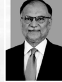
PROF. AHSAN IQBAL Federal Minister for Planning, Development & Special Initiatives of the Islamic Republic of Pakistan

It is with immense pride that I offer my warmest felicitations on the 75th Anniversary of the establishment of diplomatic relations between Pakistan and China, a friendship that has long transcended the formalities of statecraft to become something far rarer and more enduring: an Iron Brotherhood, forged in shared purpose and strengthened with every passing decade.