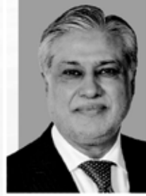
SENATOR MUHAMMAD ISHAQ DAR Deputy Prime Minister/ Minister for Foreign Affairs of the Islamic Republic of Pakistan

On the joyous occasion of the 75th Anniversary of the establishment of diplomatic relations between the Islamic Republic of Pakistan and the People's Republic of China, I extend my heartfelt felicitations to the peoples of both Pakistan and China.