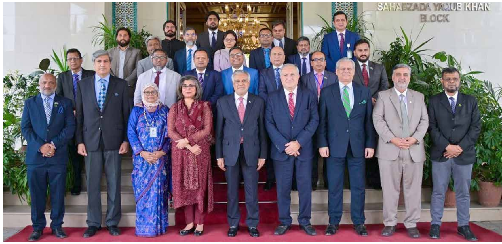
ISLAMABAD: Deputy Prime Minister/Foreign Minister Senator Mohammad Ishaq Dar welcomed a delegation of senior Bangladeshi civil servants at the Ministry of Foreign Affairs. DNA

ISLAMABAD: The Vice President of the Asian Infrastructure Investment Bank (AIIB), Konstantin Limityovskiy, along with Director General Xiaohong Wang, called on Federal Minister for Communications Abdul Aleem Khan on Wednesday to discuss the ongoing and proposed communication and infrastructure development projects across Pakistan. During the meeting, Federal Minister Abdul Aleem Khan emphasized that partnership and investment with the AIIB were of paramount importance to Pakistan, said a press release. He stated that the government aimed to complete many vital transportation and infrastructure projects within the next two years. He added that the most critical project for Pakistan right now was the Karachi-Hyderabad and Hyderabad-Sukkur Motorway which would play a pivotal role in the country's economic development. Aleem Khan assured that the Government of Pakistan would utilize all available resources to ensure its timely completion and aims to complete the project within 2 years.—APP