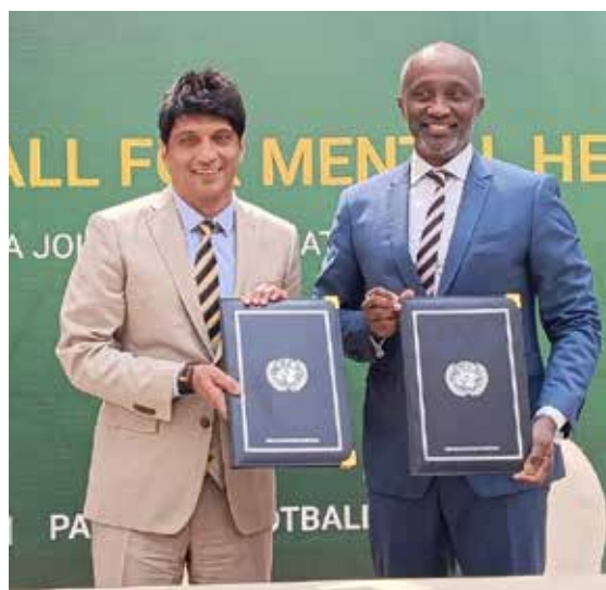
He added that the partnership with the United Nations would further strengthen the positive role of sports in Pakistan. "Youth are our future, and their mental and phys-