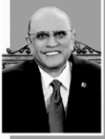
ASIF ALI ZARDARI President of the Islamic Republic of Pakistan

A FRIENDSHIP THAT TURNED DREAMS INTO REALITY