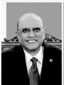
阿西夫·阿里·扎尔达里 巴基斯坦伊斯兰共和国总统

This anniversary is not a destination to rest upon. It is a renewed call to deepen our ties, diversify our collaboration and keep building, with the same conviction that brought us this far, because the most meaningful chapters of this friendship are still ahead of us.