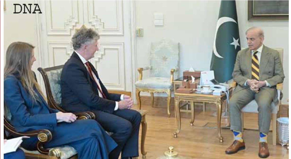
ISLAMABAD: Mr. Jonathan Powell, the UK's National Security Adviser, called on Prime Minister Muhammad Shehbaz Sharif at the Prime Minister House.

ly to take place in Islamabad after the Eid holidays. The choice of Pakistan's capital as a potential venue underscores the growing trust in Islamabad's mediatory role. In a further sign of momentum, a high-level Pakistani visit to Iran is scheduled for Thursday. Officials believe this visit could pave the way for formalizing the understanding, with speculation that a formal announcement—or "annulment" (likely referring to the termination of certain sanctions or hostile measures)—may be made soon thereafter. While no official confirmation has come from the White House or the Iranian Foreign Ministry, diplomatic circles in Islamabad are optimistic. If successful, the breakthrough would mark a major foreign policy achievement for Pakistan, positioning it as a key peace broker in one of the world's most volatile regions. Analysts caution that details remain fluid, but all signs point toward a rare diplomatic opening. The coming days, particularly after Eid, are expected to be critical in determining whether this initiative translates into a lasting agreement. Pakistan side is hopeful that the stakeholders will be able to reach an agreement thus relieving the entire world of pain and agony.