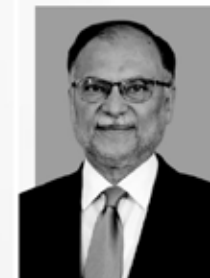
阿赫桑·伊克巴尔 巴基斯坦伊斯兰共和国联邦规划、发展与特别倡议部长

值此巴基斯坦与中国建交75周年之际，我怀着无比自豪的心情，致以最热烈的祝贺。巴中友谊早已超越国家间交往的礼节形式，升华为一种更为珍贵、更为持久的关系——这就是“铁杆兄弟情谊”。它建立在共同目标之上，并随着每一个十年的发展而日益巩固。我曾有幸作为中巴经济走廊的主管部长，并成为推动其持续发展为“中巴经济走廊2.0”的中坚力量，站在这一伙伴关系最具变革意义的篇章的中心。曾经宏伟的愿景，如今已在我国成为鲜活现实：