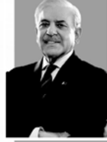
MUHAMMAD SHEHBAZ SHARIF Prime Minister of the Islamic Republic of Pakistan

I also extend my best wishes for the continued progress, prosperity and well-being of the friendly people of China.