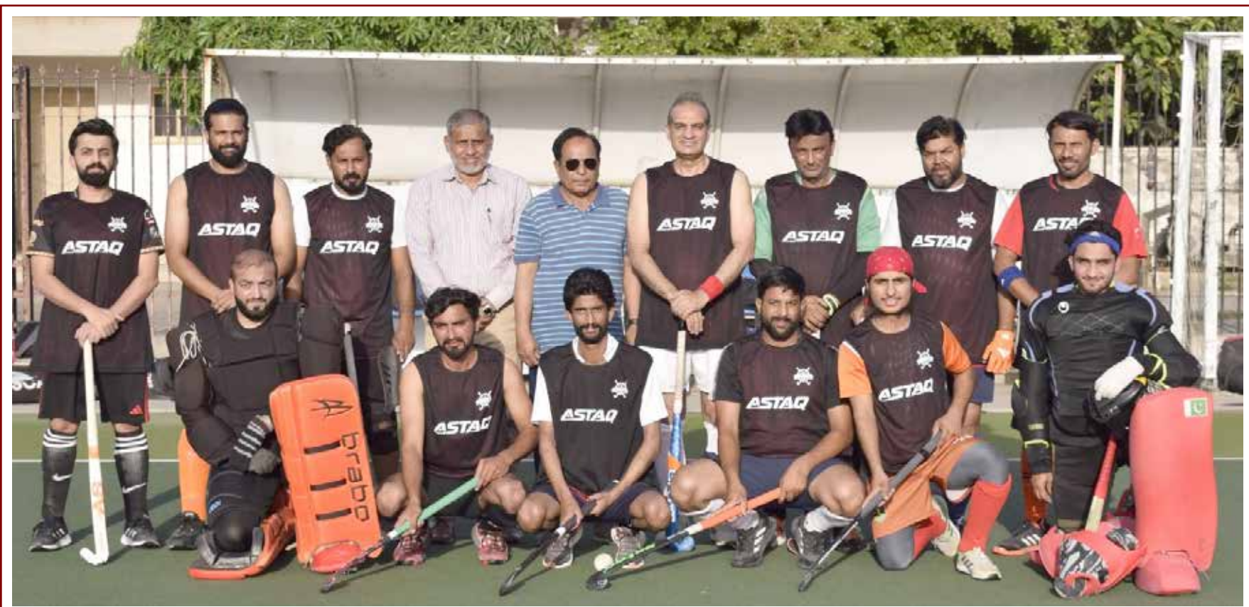
RAWALPINDI: Players of Rising Stars Hockey Club posing for a picture before the start of a match, at the Shehnaz Sheikh Hockey Stadium Rawalpindi.

FROM PAGE 01 task over President Donald Trump's assault on visas. Jaishankar said he "appreciated Secretary Rubio of challenges that legitimate travellers face in respect of visa issuance". "While we cooperate to deal with illegal and irregular mobility, our expectation is that legal mobility should not be adversely impacted as a consequence," he said, noting that visas were key for US-India tech cooperation. Trump, who has made curbing non-Western immigration a key political priority, has ramped up restrictions and fees for H-1B visas used largely by Indian tech workers, sending applications tumbling. The Trump administration followed up Friday by saying that applicants for permanent residency, even when in the United States legally, must leave for processing, likely splitting up many families for extended periods. Trump has been influenced by nationalist critics who say Indian workers take away skilled jobs from Americans who would have earned more.