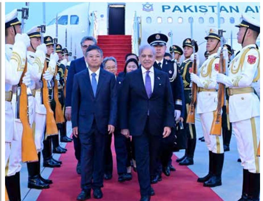
BEIJING Prime Minister Muhammad Shehbaz Sharif being received by Mr. Huang Runqiu, Minister of Environment & Ecology of China at Beijing Capital International Airport on 24 May 2026.