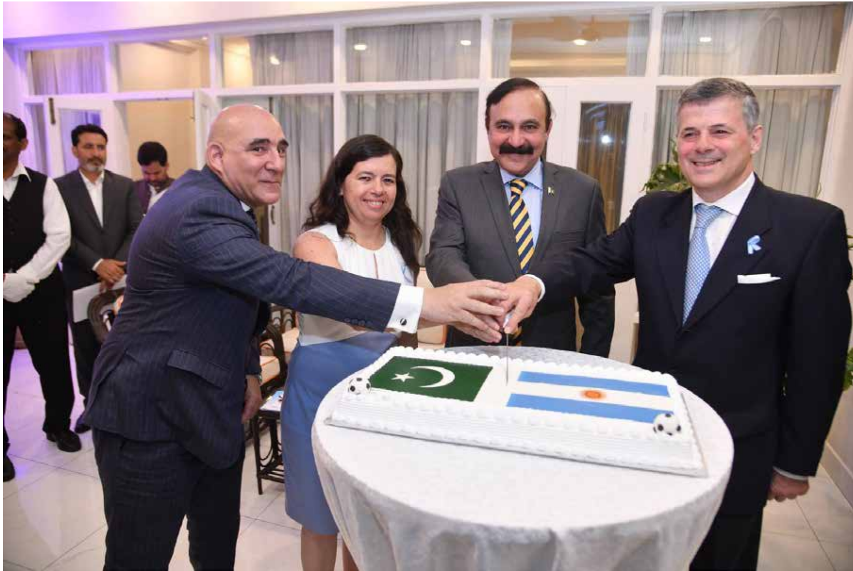
ISLAMABAD: Federal Minister Tariq Fazal Chaudhry, Ambassador of Argentina and others cutting cake to celebrate the National Day of Argentina.

ISLAMABAD: Federal Investigation Agency (FIA) Immigration Islamabad offloaded a passenger traveling abroad after detecting allegedly fake immigration stamps on his passport during scrutiny at Islamabad International Airport. An official told APP on Sunday that passenger Haroon ur Rashid was travelling to Malaysia through Etihad Airways flight EY-301 when he was referred for secondary profiling on suspicion. During the detailed examination, the official said allegedly fake immigration stamps of Pakistan, Thailand and Malaysia were found affixed on the passport. Following a preliminary investigation, the passenger was shifted to FIA Anti-Human Trafficking Circle (AHTC) in Islamabad for further legal action and registration of a case. The official said passports, mobile phones, foreign currency, e-visa and other travel documents were also taken into custody from the accused. According to FIA authorities, further investigation into the matter was underway.