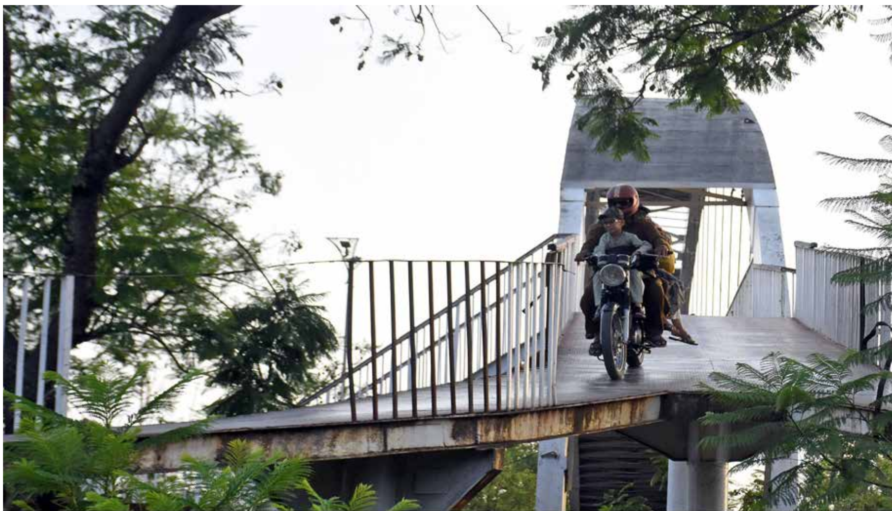
ISLAMABAD: A motorcyclist coming down from broken fence bridge with on 7th Avenue in the Federal Capital may cause any serious incidents, needs the attention of concerned authorities.