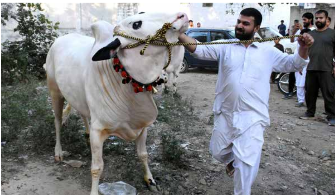
ISLAMABAD: A man trying to control his sacrificial bull in a street of Federal Capital ahead of Eid Al-Adha.