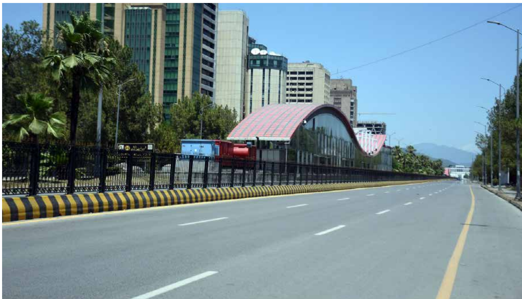
ISLAMABAD: A deserted view of Jinnah Avenue in the Federal Capital as the mostly people went to their native towns to celebrate Eid with their love ones.

According to the Saudi Press Agency (SPA), the center is operating for the third consecutive year in cooperation with several government and nonprofit organizations, including the Ministry of Hajj and Umrah, the Pilgrim Experience Program, and the National Center for Non-Profit Sector. The report said the center aims to organize and strengthen volunteer efforts through an integrated operational system designed to improve coordination among participating organizations and enhance services provided to pilgrims. Authorities said the initiative reflects Saudi Arabia's growing institutional volunteer model based on digital systems, unified operations, and real-time performance monitoring. SPA told APP that during Hajj 1446 AH, the center facilitated the participation of more than 34,000 volunteers who completed over 2.8 million volunteer hours, exceeding planned participation targets by 138 percent.—APP