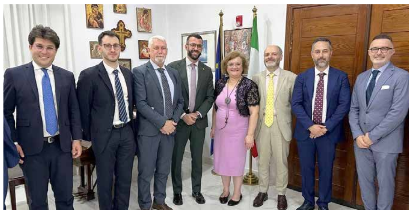
ISLAMABAD: As part of the shared commitment to countering illegal migration and migrant trafficking, the first Italian-led training course for Pakistani police officers on migration management.

In recent years, the world has been witnessing growing turbulence in the international landscape, with conflicts increasing, divisions widening and the multilateral system, along with international law, under considerable strain, he said at a briefing at the start of this month. In this regard, the Chinese envoy urged the international community to take urgent actions to uphold the authority of the UN Charter and reinforce the role of the United Nations to prevent the world from "relapsing into the jungle" and "to save succeeding generations from the scourge of war." On its part, Pakistan welcomed this timely initiative by China, which highlights the importance of strengthening multilateralism and upholding central role of United Nations in addressing today's complex global challenges. - APP