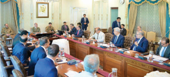
ISLAMABAD: Prime Minister Muhammad Shehbaz Sharif chairs a meeting regarding affairs of Ministry of Interior, in Islamabad on 12 May 2026.