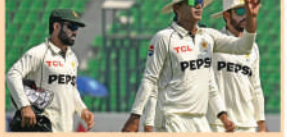
Oldest players to reach 100 Test wickets • Noman Ali (Pakistan) – 39y 217d • Bobby Peel (England) – 39y 180d • Ray Illingworth (England) – 39y 30d • Charlie Grimmer (Australia) – 39y 22d • Sydney Barnes (England) – 38y 310d Fastest Pakistani bowlers to 100 Test wickets • Yasir Shah – 17 matches • Saeed Ajmal – 19 matches • Waqar Younis – 20 matches • Mohammad Asif – 20 matches • Noman Ali – 22 matches* • Fazal Mahmood – 22 matches • Saqlain Mushtaq – 23 matches