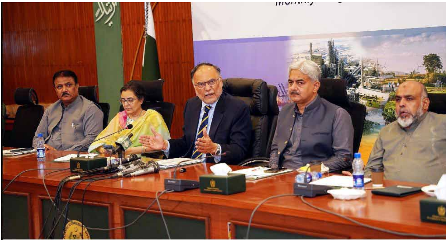
ISLAMABAD: Federal Minister for Planning, Development and Special Initiatives, Ahsan Iqbal addressing a media briefing about monthly development update.