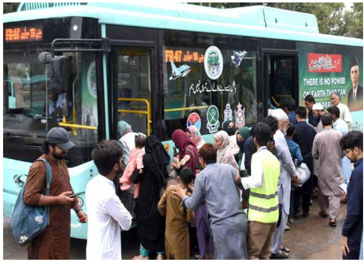
ISLAMABAD: People boarding on electric bus during rain in the Federal Capital.