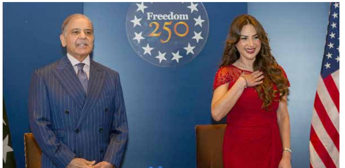
ISLAMABAD: Prime Minister Shehbaz Sharif attending the Independence Day celebration of the United States of America. US Acting Ambassador Natalie Baker also present.