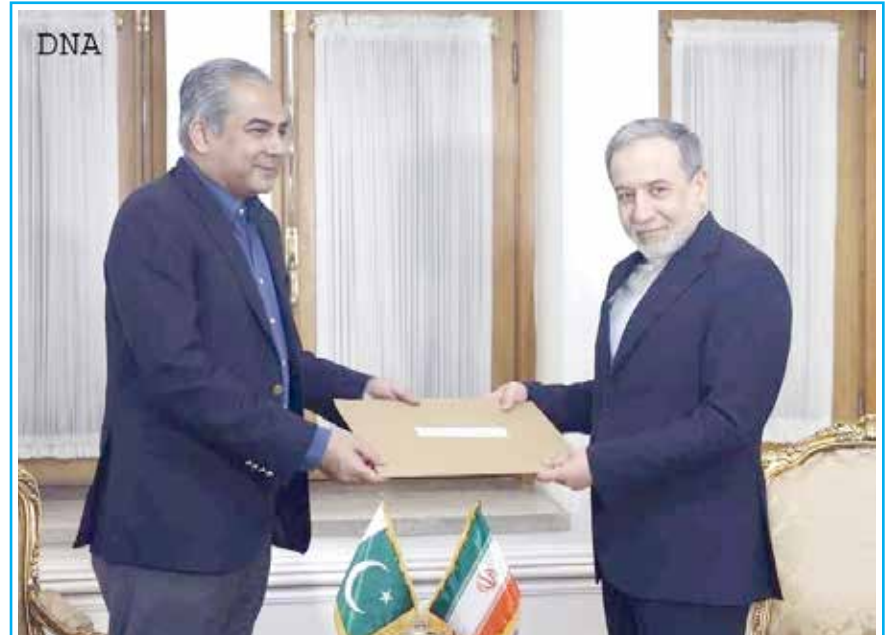
TEHRAN: Pakistani Interior Minister Mohsin Naqvi met with Iran's FM Araghchi in Tehran. Naqvi delivered Field Marshal Asim Munir's letter addressed to the supreme leader.