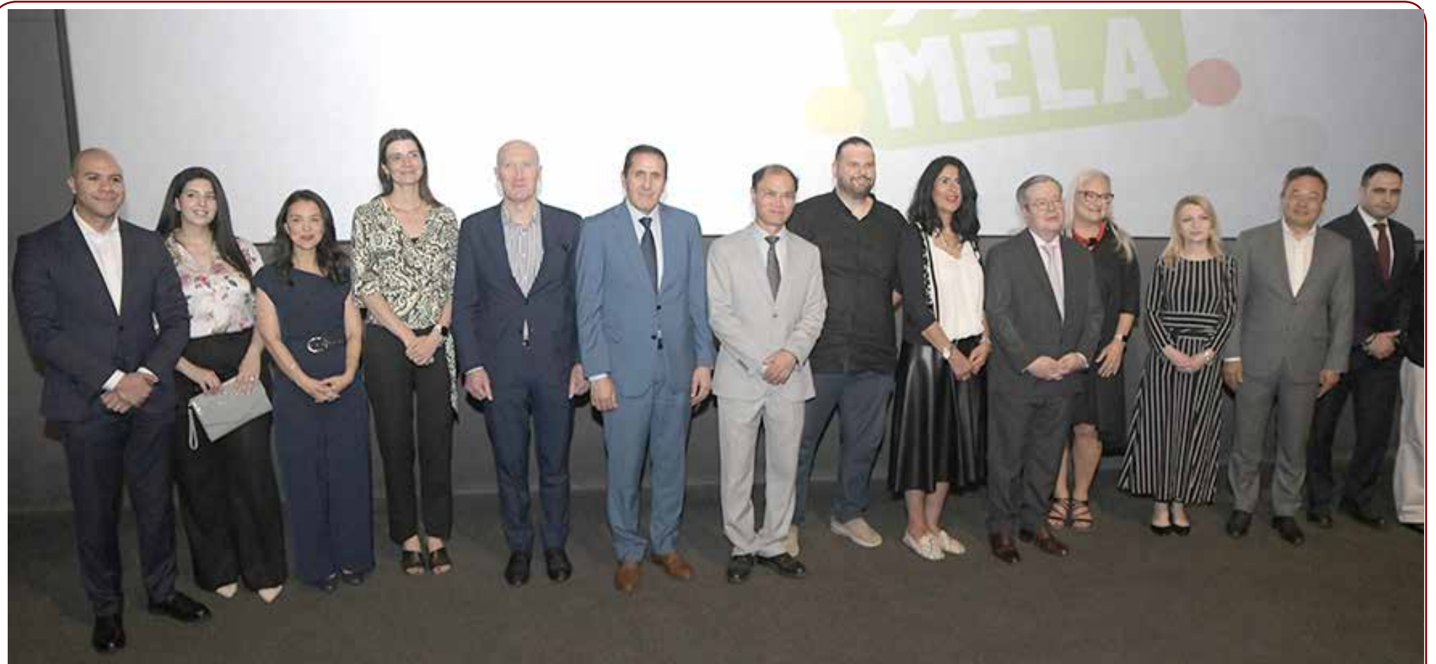
ISLAMABAD: Representatives of participating countries at the Francophone Film Mela pose for a group photo during the screening of a Canadian film, marking the formal opening of the festival. French Ambassador to Pakistan Nicolas Galey addressed the gathering and shared details of the event, announcing that after Islamabad, the film mela will also be held in Lahore and Karachi.