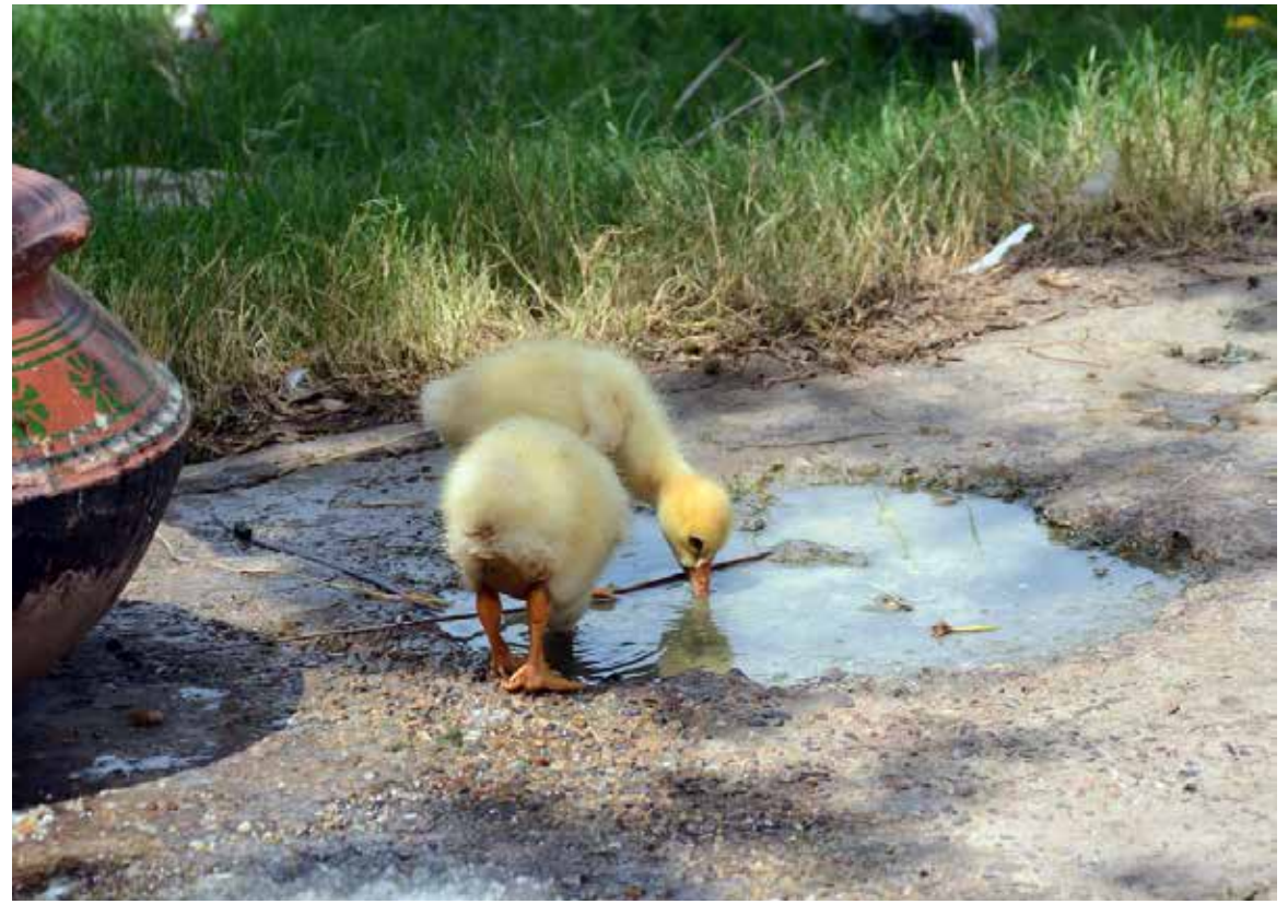
MULTAN: A newly hatched duckling drinks water from a puddle to quench its thirst on a hot day.

tal damage may amount to tens of millions of rupees. The local authorities have launched an investigation to determine the cause of the fire and assess the extent of the losses. Following the incident, affected traders appealed to the government for immediate financial assistance and compensation. Many shopkeepers said that their lifetime savings and investments were wiped out within a matter of hours. No casualties have been reported so far, while officials continue to evaluate the damage and gather further details about the incident.—APP