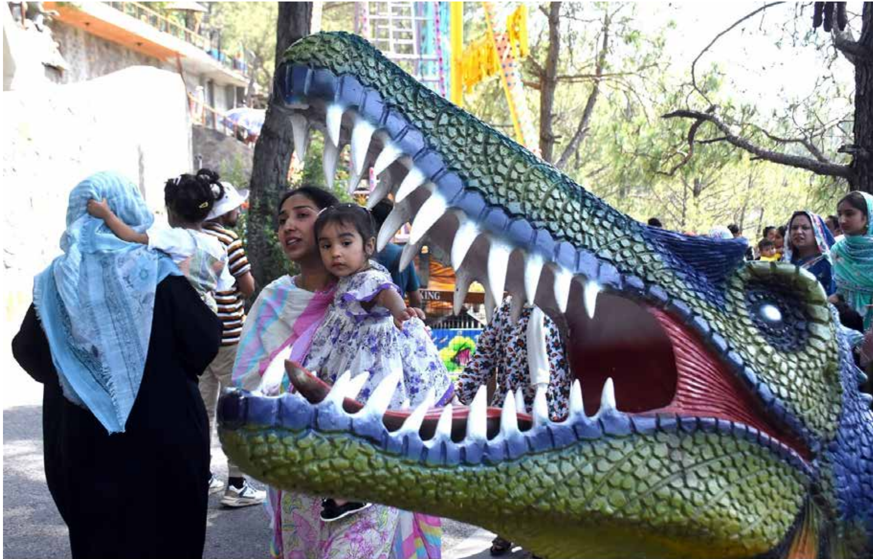
ISLAMABAD: Families visiting the Dino Valley in Margallah Hills in the Federal Capital. The Dino Valley is located near Pir Sohawa and features life-sized dinosaur models and rides, making it a popular location for families.

FROM PAGE 01 discussions with Iran's Interior Minister Eskandar Momeni, who praised Pakistan's efforts and highlighted the importance of collaboration in addressing shared challenges. Such diplomatic overtures reflect a broader strategy by Pakistan to deepen its role in regional affairs, balancing relationships across its borders while navigating complex geopolitical realities. At the same time, Lebanon remains mired in instability as clashes between Israel and Hezbollah intensify. The fighting has exacerbated humanitarian concerns, with civilians bearing the brunt of the violence. Lebanon's fragile political and economic situation has been further strained, leaving the country vulnerable to external pressures and internal divisions. The ongoing conflict risks spilling over into wider regional instability, drawing in neighboring states and complicating diplomatic efforts aimed at de-escalation. International observers warn that without meaningful intervention, Lebanon's crisis could deepen, undermining prospects for peace and stability in the broader Middle East.