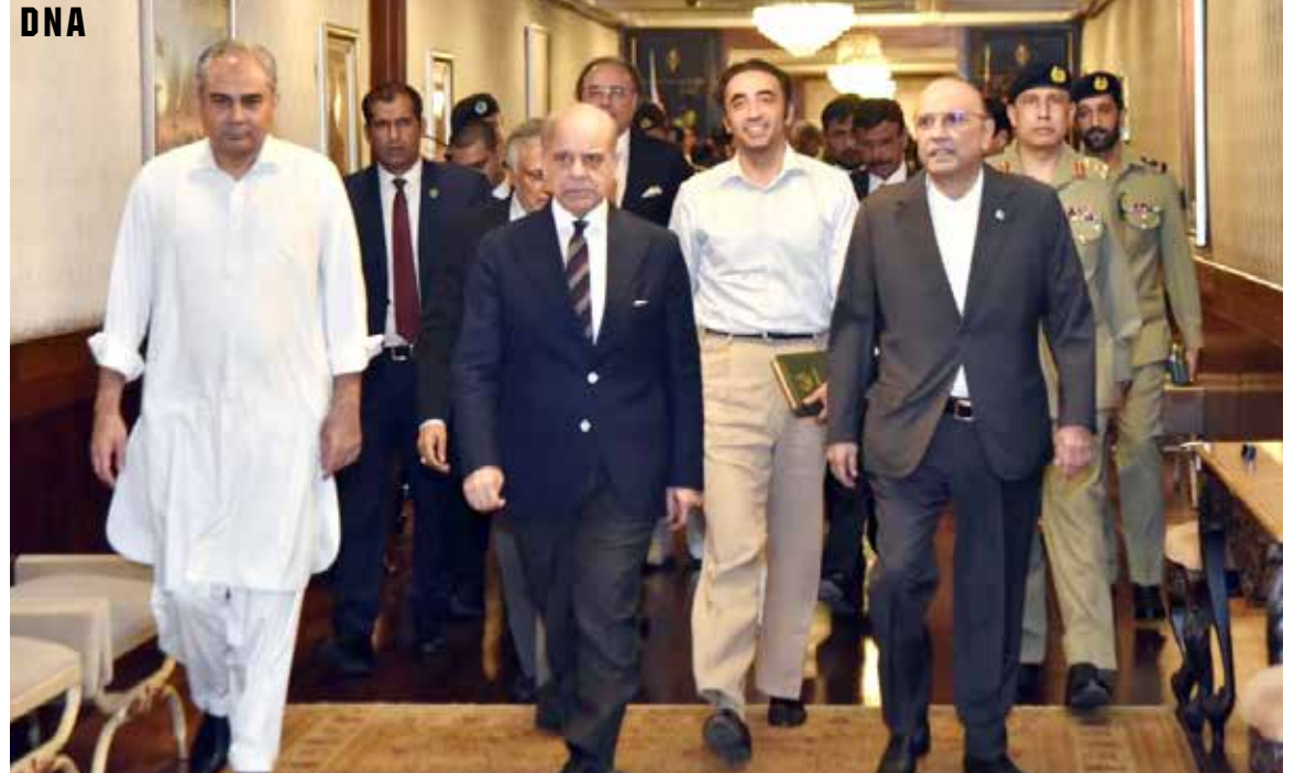
ISLAMABAD: Prime Minister Shehbaz Sharif along with his team arrive at the Presidency to meet President Asif Ali Zardari.