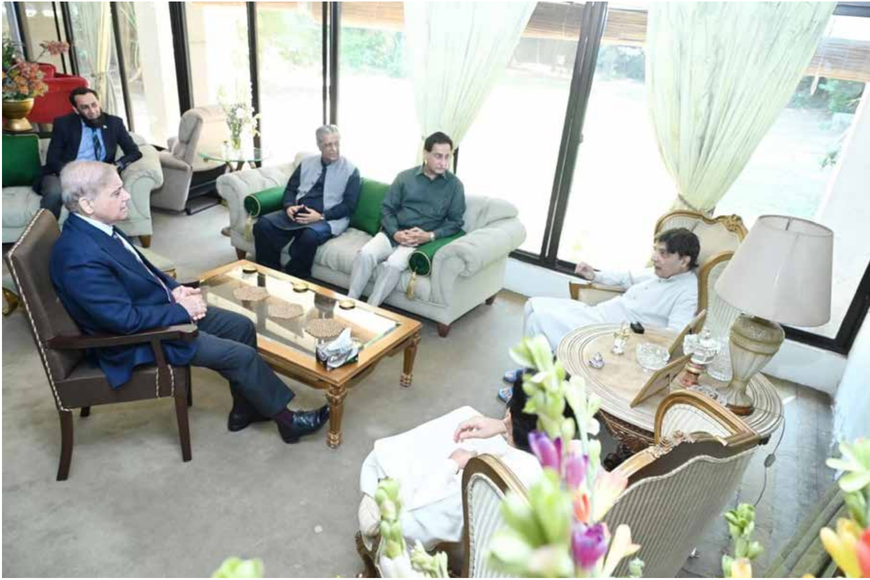
ISLAMABAD: Prime Minister Muhammad Shehbaz Sharif visits the residence of senior politician Chaudhry Nisar Ali Khan .