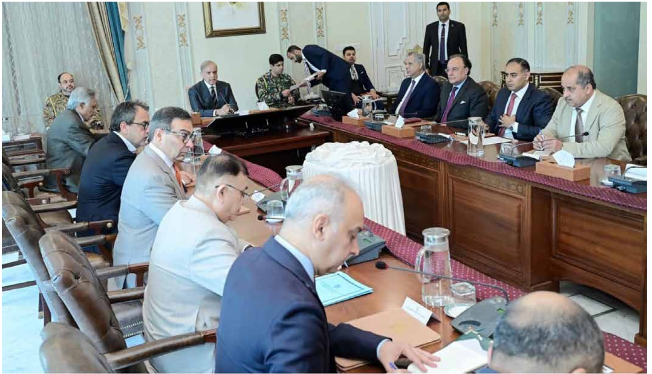
ISLAMABAD: Prime Minister Muhammad Shehbaz Sharif chairs review meeting on privatisation of DISCOs.