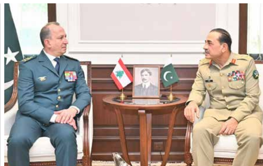
RAWALPINDI: General Rodolphe Haykal, Commander-in-Chief of the Lebanese Armed Forces, called on Field Marshal Syed Asim Munir, NI (M), HJ, COAS & CDF, at General Headquarters (GHQ).