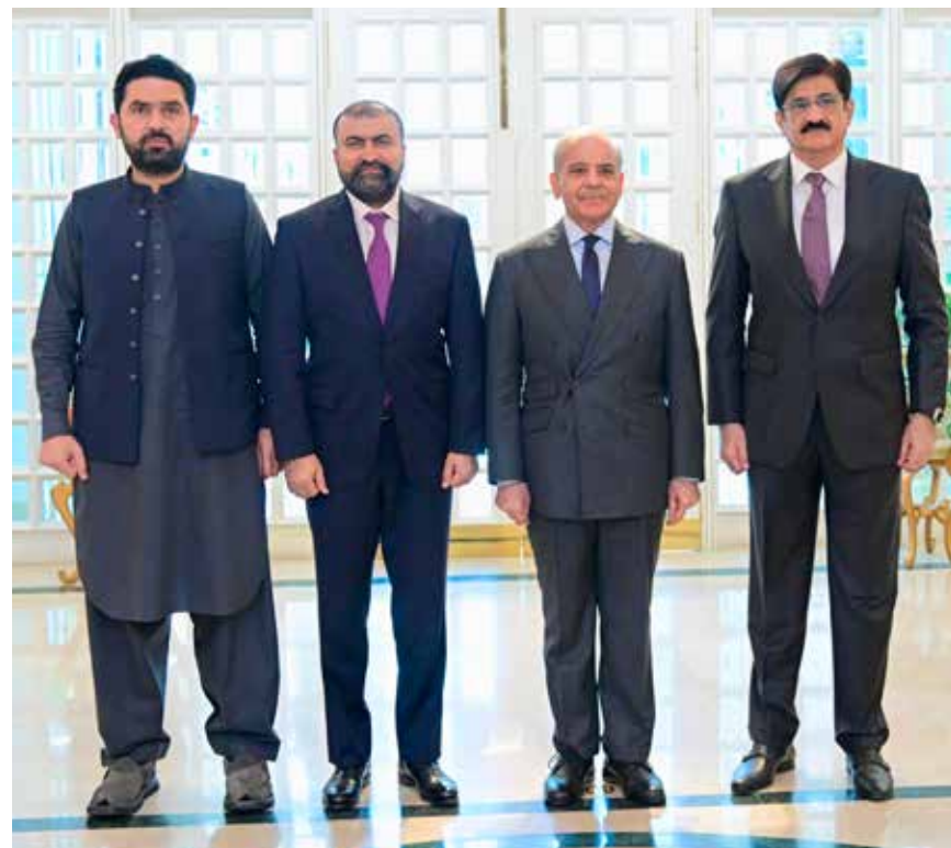
ISLAMABAD: Chief Ministers of all provinces posing for a picture with the Prime Minister of Pakistan Shehbaz Sharif. — DNA

RAWALPINDI: over a dozen people were killed and 13 were injured when a fire broke out in a van after it fell into a nullah while taking a turn on the Islamabad-Murree Expressway near Khajut on Monday, the National Highways & Motorway Police (NHMP) said. The NHMP statement said the Hiace van had fallen in such a manner that it was not possible for the passengers to open its door. "The victims are from the same family and were travelling from Multan to Murree," it said. The bodies and the injured were taken to the Pakistan Institute of Medical Sciences in Islamabad, the statement said, adding that relief and rescue efforts were initiated after contingents of the motorway police and the district administration reached the site. Last month, a heavy rush was reported on the Murree Expressway as traffic from the Murree Road was diverted there due to reconstruction work.