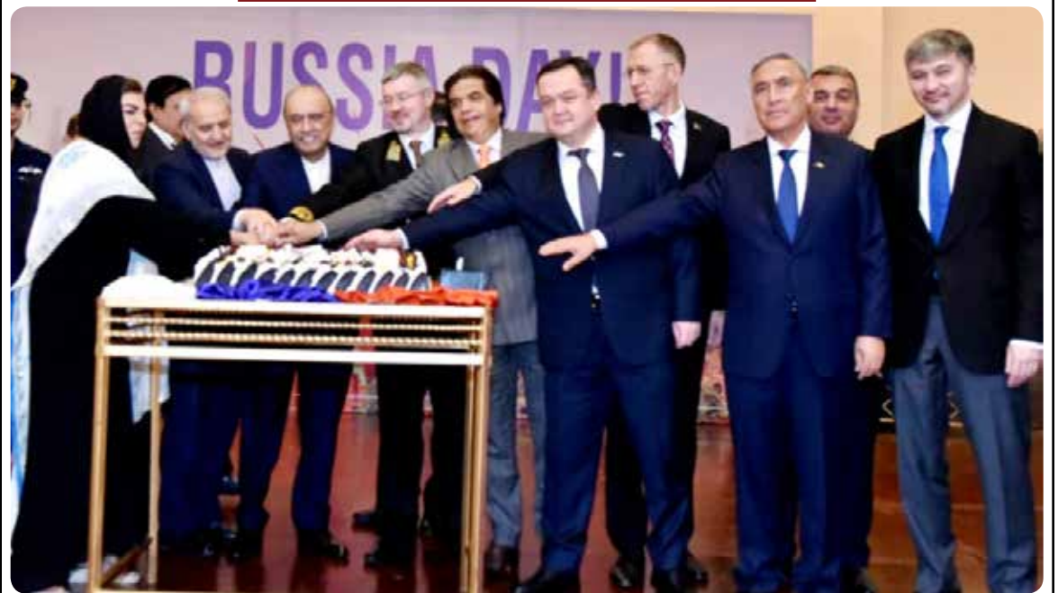
ISLAMABAD: Chief Guest President Asif Ali Zardari, Ambassador of Russia Albert P Khorev and others cutting cake to celebrate the National Day of Russia, held at Islamabad Serena Hotel.