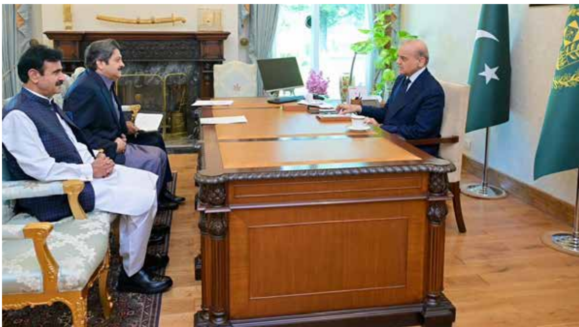
ISLAMABAD: Member National Assembly Ch. Nasser Ahmed Abbas calls on Prime Minister Muhammad Shehbaz Sharif on 10 June 2026. DNA

capacity, enhancing energy security, creating jobs, and attracting long-term foreign and domestic investment," the Minister said. He further noted that the government is committed to facilitating investment that contributes to economic growth, industrial modernization, import substitution, and export enhancement. The delegation also shared its broader vision for the future development of associated petrochemical facilities, including the production of industrial feedstocks and value-added products that could support Pakistan's manufacturing sector and generate additional export opportunities. Both sides agreed on the importance of continued public-private sector collaboration to accelerate industrial investment and unlock Pakistan's full economic potential. The meeting concluded with a shared commitment to advancing strategic projects that support sustainable growth, employment generation, and national economic development.