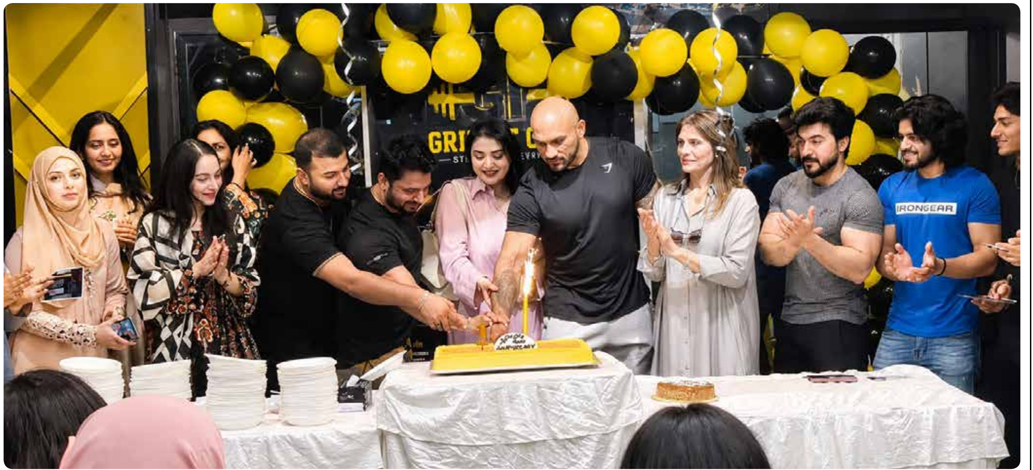
ISLAMABAD: The members and management of the Grifit Gold G-11 Gym G 11 cutting cake to celebrate the anniversary. — DNA