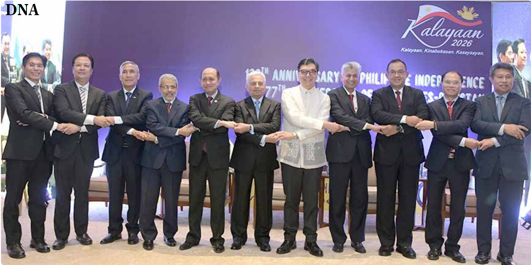
ISLAMABAD: Federal Minister Rana Tanvir Hussian, Presidential spokesperson Murtaza Solangi, Ambassadors of the ASEAN member countries posing for a picture in traditional ASEAN style on the occasion of the Independence Day of the Philippines.