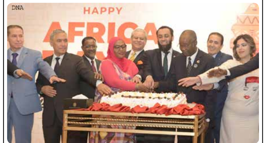
ISLAMABAD: Federal Information Minister Attaullah Tarar and Ambassadors of the African countries cutting cake to celebrate the African Day.