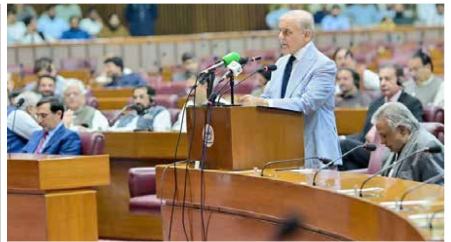
ISLAMABAD: Prime Minister Shehbaz Sharif giving policy statement about US-Iran deal.