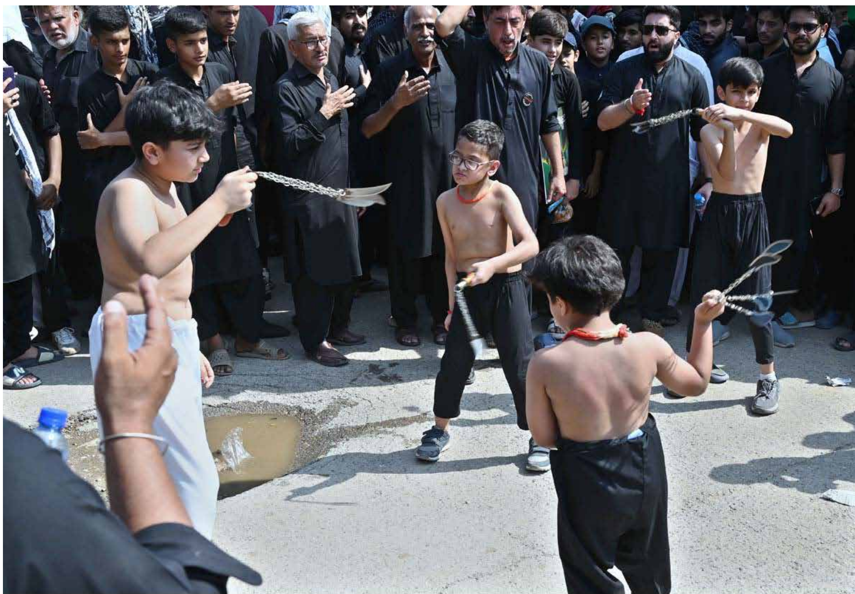
ISLAMABAD: Mourners oozing themselves with knives and chains during main procession on 9th Muharramul Haram.