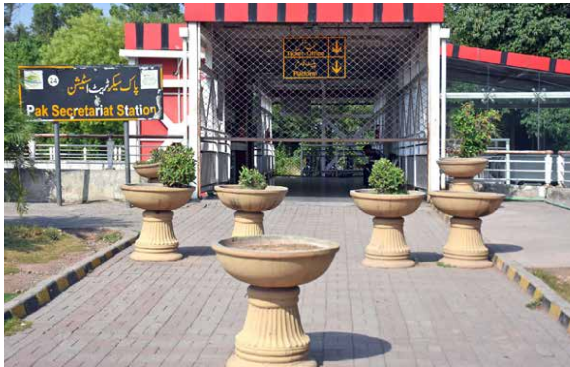
ISLAMABAD: A view of the closed metro bus station as the metro services suspended in connection with security and traffic arrangements for Ashura procession in the Federal Capital.

crimes and safeguard public interest. He stated that stronger coordination between the two institutions would improve enforcement effectiveness, enhance accountability, and serve as a strong deterrent against illegal deposit-taking and other fraudulent financial practices. The SECP reiterated that the mere registration of a company does not authorize it to solicit or accept deposits from the general public. Under Section 84 of the Companies Act, 2017, deposit-taking by companies, other than banking companies and entities specifically licensed by the SECP is strictly prohibited and unlawful