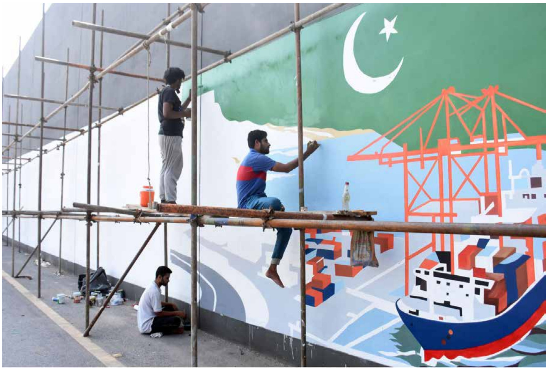
ISLAMABAD: Artists making paintings at Jinnah Square Underpass for beatification purpose.