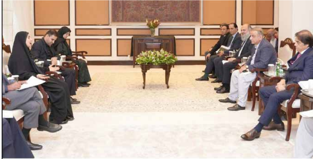
ISLAMABAD: Iranian Minister for Transport Ms. Farzaneh Sadegh called on Federal Minister for Communications Abdul Aleem Khan & Federal Ministers Hanif Abbasi, Jam Kamal and Junaid Anwar and held meeting.

ISLAMABAD: Pakistan and Iran on Thursday agreed to fully activate the Pakistan-Iran Joint Transport Committee and take coordinated measures to resolve transport and logistics issues on a priority basis to enhance bilateral trade and regional connectivity. The understanding was reached during a high-level meeting between Iran's Minister of Roads, Urban Development and Transport, Farzaneh Sadegh, and a Pakistani delegation led by Federal Minister for Communications Abdul Aleem Khan during her visit to Pakistan, said a press release. The meeting focused on regional connectivity, trade promotion and enhancing bilateral cooperation. The Pakistani delegation included Federal Minister for Railways Hanif Abbasi, Federal Minister for Commerce Jam Kamal Khan and Federal Minister for Maritime Affairs Junaid Anwar Chaudhry. During the meeting, Abdul Aleem Khan expressed deep satisfaction over the restoration of peace in the region and commended the resilience and determination of the Iranian people. He emphasized that road and rail connectivity between Pakistan and Iran would be further strengthened in the future, noting that robust land links are essential for expanding trade opportunities between the two neighbouring countries. Both delegations held detailed discussions on various proposals aimed at improving bilateral logistics and agreed to fully activate the Pakistan-Iran Joint Transport Committee.