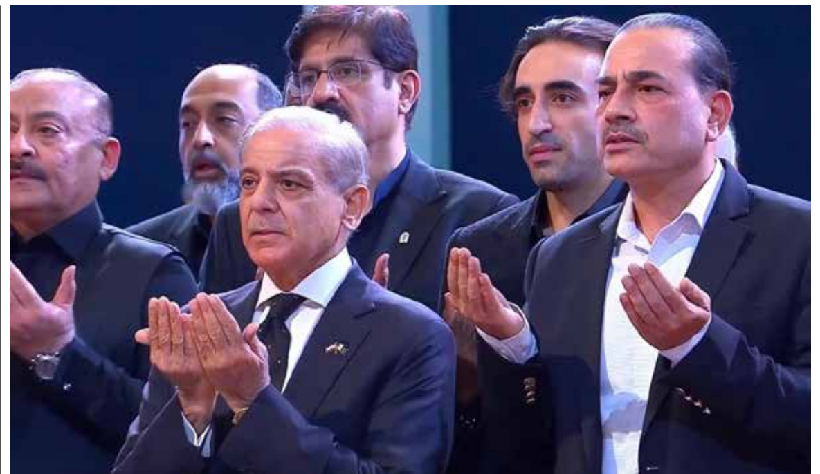
TEHRAN: Prime Minister Muhammad Shehbaz Sharif along with high level Pakistani delegation offering فاتحة for the departed soul of the Iranian supreme leader. Field Marshal Asim Munir and PPP Chairman Bilawal Bhutto Zardari also present on the occasion.

India to buy military equipment worth $5.46bn