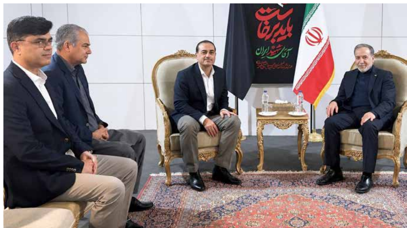
TEHRAN: Field Marshal Asim Munir in a meeting with Iranian foreign minister during his recent visit to Iran.

GAZA: Medical sources in the Gaza Strip said that the death toll from Israel's ongoing military aggression has risen to 73,074 Palestinians, with 173,537 others injured since October 7, 2023. According to local health authorities, hospitals across the enclave received four fatalities, including two recovered from beneath the rubble, and 12 injured people over the past 24 hours. The sources added that since the ceasefire started on October 11 last year, 1,059 Palestinians have been killed and 3,429 injured, while 788 bodies have been recovered. Authorities said further that a number of victims remain trapped beneath the rubble and on roads, as ambulance and civil defense crews are still unable to reach them.