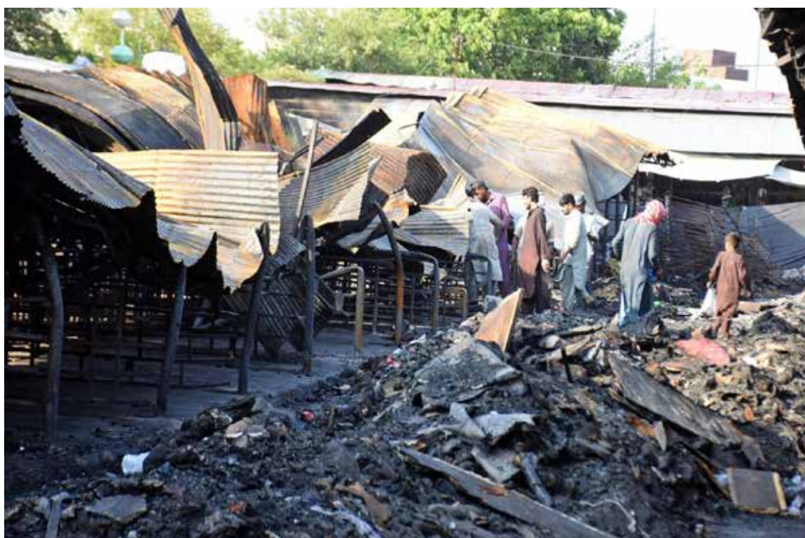
ISLAMABAD: Following the devastating fire at Islamabad's H-9 Sunday Bazaar in the Federal Capital, Stall holders taking matters into their own hands to clean and restore their livelihoods without official assistance is a testament to incredible resilience.

adding that the provincial government had increased the police budget to further strengthen law and order. During the meeting, officials informed the CM that work was underway on 139 development projects in Hazara Division under the Provincial Annual Development Programme. The meeting was also told that 1,879 out of 2,111 complaints received through the Pakistan Citizen Portal had been resolved, more than 100 open public forums had been held under the government's open-door policy, land records had been fully digitised in Abbottabad and Battagram, while digitisation had reached 97 percent in Haripur and 90 percent in Mansehra. Officials further said that 20 police facilitation centres were operational across the division, with six more under construction.