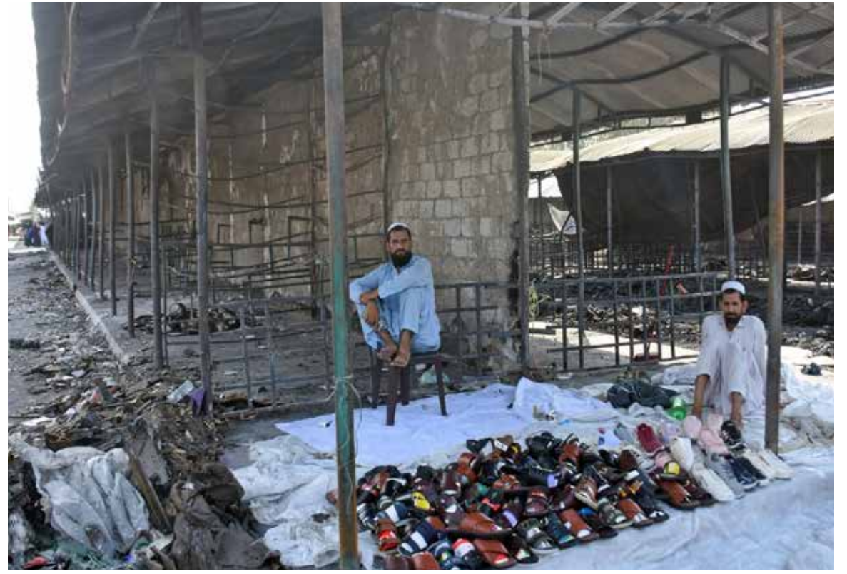
ISLAMABAD: Stall holders waiting for customers after clean their burnt stall without help any authorities at H-9 Weekly Bazaar in the Federal Capital.