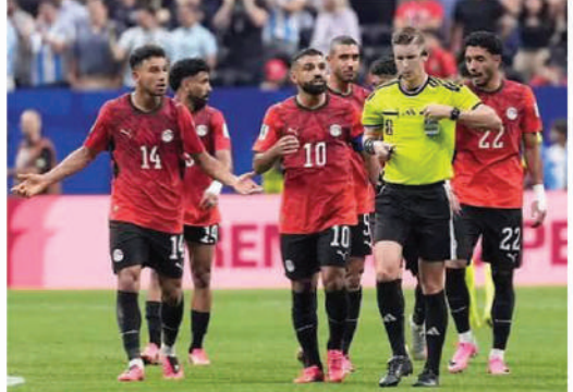
Coach Hossain Hassan alleged after the match there may have been pressure on the referee to keep Argentina in the tournament. And the Egyptian Football Association said "several key incidents raised serious concerns and left profound questions about the consistency and fairness of decisions that directly influenced the course of the game." Egypt argued that Mostafa Zico's second-half strike was incorrectly ruled out for what it described as a non-existent foul in the build-up. Egypt were also incensed that a challenge on Mohamed Salah was not penalised moments before Argentina handed the move that produced the winning goal. Fifa's Collina said VAR had correctly recommended overturning Zico's goal after identifying a foul by Marwan Attia on Argentinian defender Lisandro Martinez during the attacking possession phase. "We believe that a foul is a foul," Collina said. "Regardless of whether the foul appears 'obvious', if the referee did not see it on the field, the VAR can intervene." Collina also defended the decision not to award Egypt a penalty before Argentina's winner, saying both the referee and VAR judged the contact between Salah and Julian Alvarez to be "normal football contact". "It was not an opponent's foot is a foul, whereas a defender who touches the ball first and then makes normal football contact has not committed a foul," he said. While acknowledging that some decisions would always require an element of subjectivity, Collina said Fifa was satisfied with how VAR principles had been applied throughout the tournament.

IFIFA refereeing chief Pierluigi Collina defended the officiating in Argentina's 2-1 victory over Egypt in the World Cup round of 16, dismissing allegations of bias and saying match officials operated with complete independence. In an interview published on FIFA website on Thursday, Collina said the criticism of referees was part of football but he condemned the questioning of the officials' integrity after Egypt complained about the officiating following the defeat. "Constructive discussion about decisions will always be part of football, but unfounded allegations have no place in our sport," Collina said. "Nobody can question the integrity of the Fifa World Cup match officials... Nobody can claim that 'Fifa refereeing can be biased' by anyone, not even by the Fifa president (Gianni Infantino)," Collina said that such allegations could provoke threats against referees and their families. Egypt exited the tournament but claimed they had been treated unfairly after Argentina overturned a 2-0 deficit to snatch victory with a stoppage-time winner from Enzo Fernandez.