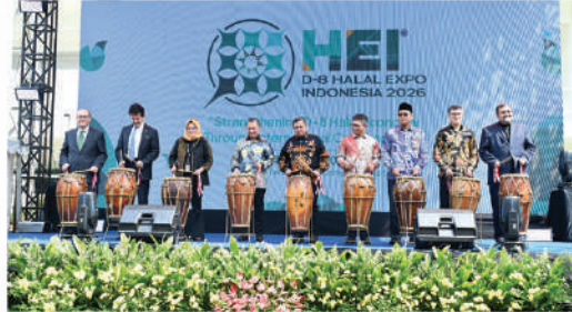
D8 Organization, extended his warm felicitations to the Government of Indonesia on successfully hosting the first-ever D8 Halal Expo and commended its leadership in advancing the halal economy as a key driver of sustainable development, industrial transformation, and regional economic integration. He particularly welcomed Indonesia's proposal to institutionalize the D8 Halal Expo as an annual flagship event and to host the proposed D8 Halal Economy Cooperation (HEC) Secretariat, describing these as far-reaching initiatives that would further strengthen the Organization's institutional architecture while fostering enhanced policy coordination, private-sector engagement, research collaboration, capacity building, and intra-D8 trade and investment. The Secretary-General noted that the D8, representing more than 1.28 billion people and a combined GDP exceeding US$5 trillion, possesses the complementary strengths required to become a globally competitive hub for halal production, trade, investment, and innovation. He observed that although the global halal

JAKARTA: The first-ever D8 Halal Expo Indonesia (HEI) 2026 was officially inaugurated on 8 July in Jakarta marking a major milestone in advancing economic cooperation and strengthening the halal economy among the Member States of the Developing 8 Organization for Economic Cooperation (D8). With the thematic focus on "Strengthening D8 Halal Economy Through International Collaboration," the 5-day event brings together Ministers, Senior Officials, business leaders, investors, entrepreneurs, and halal industry stakeholders from across the D8 region and beyond to promote trade, investment, innovation, and strategic partnerships throughout the global halal ecosystem. The Opening Ceremony for HEI was officiated by H.E. Anis Matta, Vice Minister of Foreign Affairs of the Republic of Indonesia, along with senior representatives of the National Committee for Islamic Finance, the Indonesian Agency (KNEKS), the Halal Product Assurance Agency (BPPI), the Halal Fund Management Agency (BPPIK), and Ambassadors and Officials from D8 Member States, as well as other noted dignitaries. In a special video message on the occasion, H.E. Ambassador of Pakistan Mahmood, Secretary-General of the