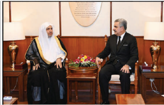
ISLAMABAD: Chief Justice of Pakistan, Justice Yahya Afridi meeting with Sheikh Dr. Muhammad bin Abdulkarim Al-Hasa, Secretary General of the Muslim World League (MWL) at the Supreme Court of Pakistan.