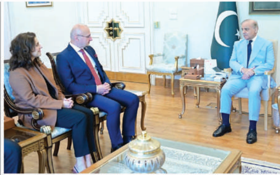
ISLAMABAD: Minister for Foreign and European Affairs of the Republic of Croatia, H.E. Dr. Gordan Grlic Radman calls on Prime Minister Muhammad Shehbaz Sharif. - DNA

ISLAMABAD: In a telephone conversation with Chief of Defence Forces (CDF) General Asim Munir, Iran's Foreign Minister Abbas Araghchi strongly condemned recent United States military strikes on Iranian territory, terming them a violation of the Islamabad Memorandum of Understanding (MoU). According to official sources, Araghchi conveyed Tehran's deep concern over what he described as "unprovoked aggression" that undermines regional stability and breaches commitments made under the bilateral framework. He stressed that the attacks not only threaten Iran's sovereignty but also erode trust in international agreements designed to prevent escalation. General Munir, during the exchange, reaffirmed Pakistan's commitment to peace and stability in the region. He emphasized the importance of dialogue and adherence to established accords, including the Islamabad MoU, which was intended to foster cooperation and prevent unilateral military actions. The conversation comes amid heightened tensions following the US strikes, which have drawn criticism from several quarters. Observers note that Araghchi's direct outreach to Pakistan's military leadership underscores Iran's intent to rally regional support against what it views as violations of international norms.